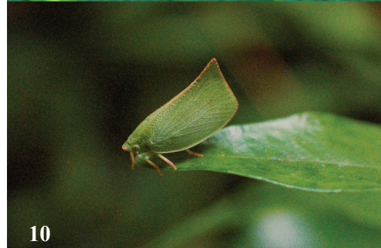
Fig. 8 (above) The stick insect Carausius morosus (Photo: Paulo A.V. Borges); Fig. 9 (intermediate) The leafhopper Cicadella viridis (Photo: Nuno Bicudo da Ponte); Fig. 10 (below) The planthopper Siphanta acuta (Photo: Nuno Bicudo da Ponte)

Cicadella viridis is a polyphagous Holarctic leafhopper widespread in the Old World including Europe (Young 1977). It prefers wet areas, feeding on grassy plants (e.g., Phragmites , Arundo and Juncus ). It has been occasionally reported as a minor pest in orchards (Frediani 1956). The forewings of the female are bright turquoise green, but those of the male are much darker blue-purple and may even be blackish. This leafhopper is a new record to the Azores. It was first