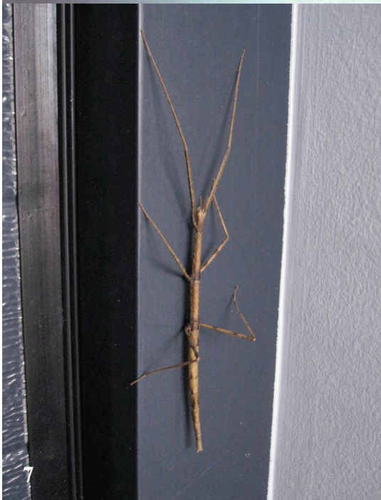
Fig. 5 (above). Paratettix meridionalis ; Fig. 6 (intermediate) The sword-tail cricket Trigoniidium cicindeloides; Fig. 7 (below) The stick insect Clonopsis gallica.