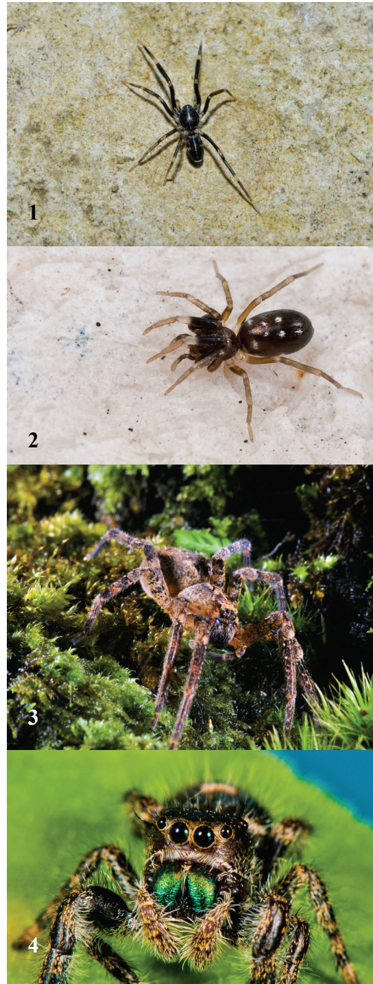
Fig. 4 (below) The bold jumping spider Phidippus audax

(on the right) Fig. 1 (top) The ant mimic (myrmecomorphic) spider Liophrurillus flavitarsis. Fig. 2 (second from above) The ant mimic (myrmecomorphic) spider Phrurolinillus lisboensis; Fig. 3 (third from above) The spider Zoropsis spinimana ;