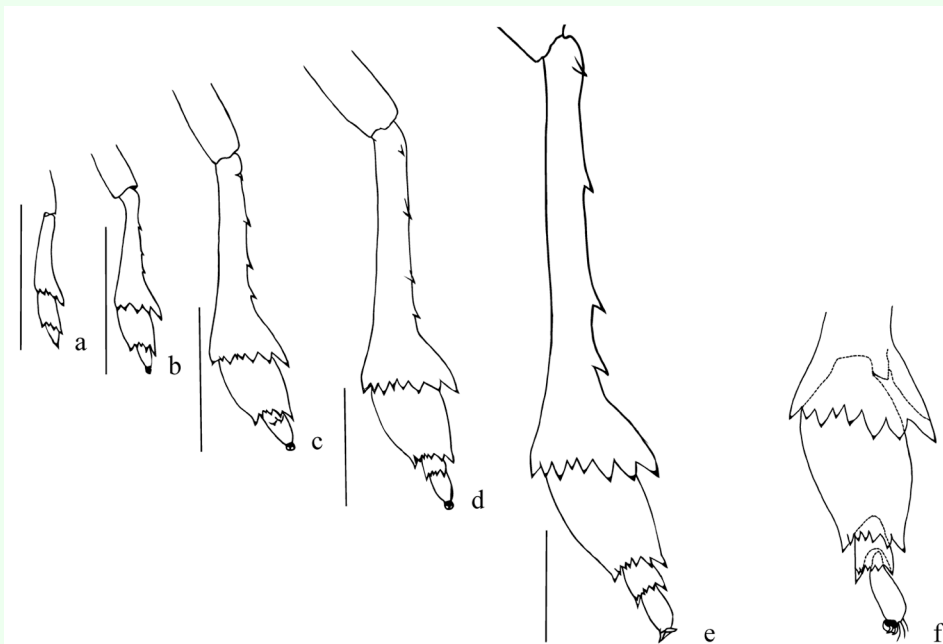
Figure 3. Metatibia and metatarsi of Taosa (C.) longula . (a) first instar; (b) second instar; (c) third instar; (d) fourth instar; (e) fifth instar; (f) apex of metatibia and tarsal segment, ventral. High quality figures are available online.