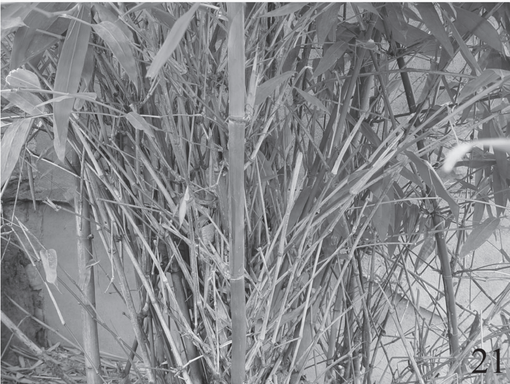
Figs. 20-21. Host plant of Tambinia bambusana sp. nov. 20. View of the area where the specimens of T. bambusana were captured, in Nandan (Guangxi, China) with Dendrocalamus latiflorus Munro; 21. View of the plant, D. latiflorus Munro.