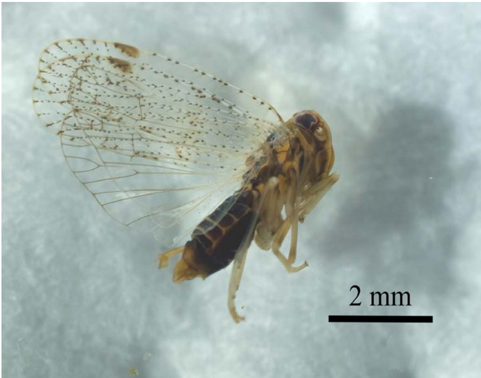
Fig. 2. Male of Cixius pallipes .

Cova des Coll (Felanitx) U.T.M 522770 / 4364500-11: 1 ♂ 2-X-2004, M Vadell leg.,