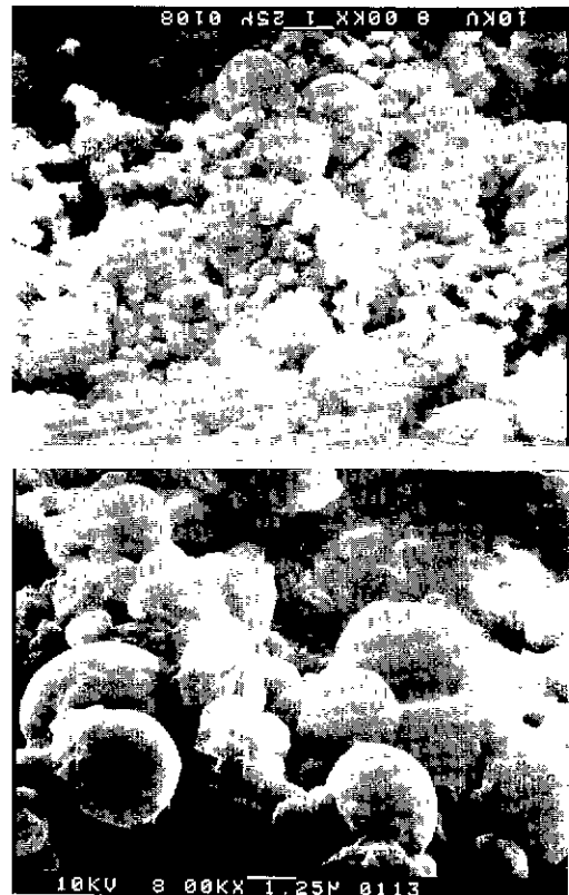
Fig. 2. Morphological differences between healthy and infected exoepithelial tissue of inner abdominal tissue of the hypodermic layer of abdomen of Nilaparvata lugens Stal. by Scanning Electron Microscopy.

Preliminary observation by SEM of intact and/or longitudinal sections of morbid bph revealed that no bacterial cells were present at the surface of intact bph or head of half-cut specimen. Numerous bacteria were apparently