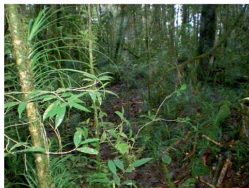
Figures 11–13. Forest at study site in Madang Province; 11. at 700 m a.s.l.; 12. at 1,200 m a.s.l.; 13. at 1,700 m a.s.l.