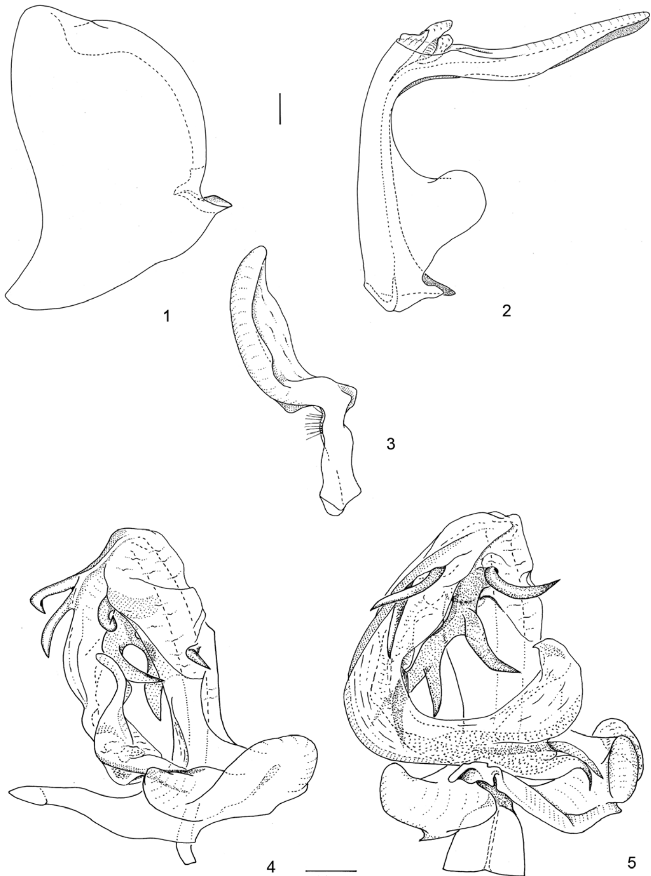
Figures 1–5. Bennaria damisa sp n., male genitalia. 1. Genital segment, left lateral aspect; 2. Anal segment, left lateral aspect; 3. Left paramere, maximal aspect; 4. Aedeagus, left lateral aspect; 5. Aedeagus, dorsal aspect. Scale bar: 0.1 mm.