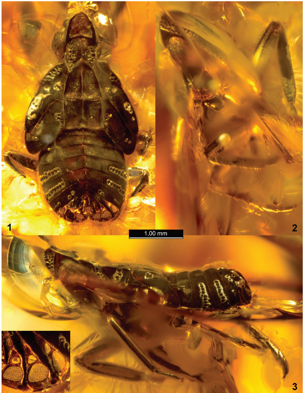
Figures 1–3. Alicodoxa rasnitsyni gen. et sp. n. (Orthopagini), 4th instar nymph, Rovno amber: 1 dorsal view 2 anteroventral view 3 lateral view (all to same scale); inset, wax plates of the right side, enlarged.

arrow-shaped anteriorly (its lateral carinae anteriorly converging at nearly acute angle, running parallel to posterior pronotal margin). Group of 6–7 pits (3 medial pits larger) situated laterad of lateral carinae. Fore wing pads mediad of subcostal carina with 3 pits (in triangle) in middle part and 1 pit near apex, and in costal area with 2 pits in middle