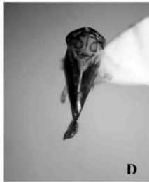
Agalliopsis pepino (2 to 3 mm)