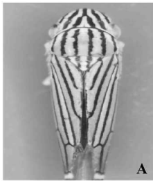
Caribovia coffeicola (7 to 9 mm)