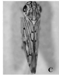
Apogonalia imitatrix (5 to 6 mm)