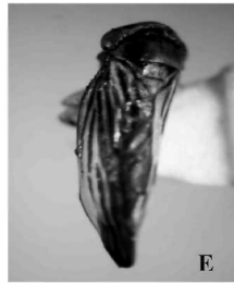
Agallia pulchra (3 to 4 mm)