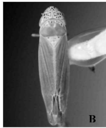
Hortensia similis (6 to 7 mm)