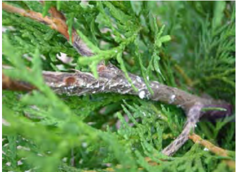
Pictures 6- Characteristic aspects of the attack on the white cedar branches (original)