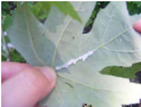
Pictures 5- Colonies of larvae located on the main rib of the leaf (original)