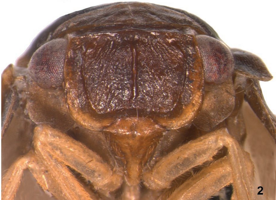
1-2. Mulvia trialbofasciata n. sp.: 1 – habitus, lateral view; 2 – anterior part of body, frontal view