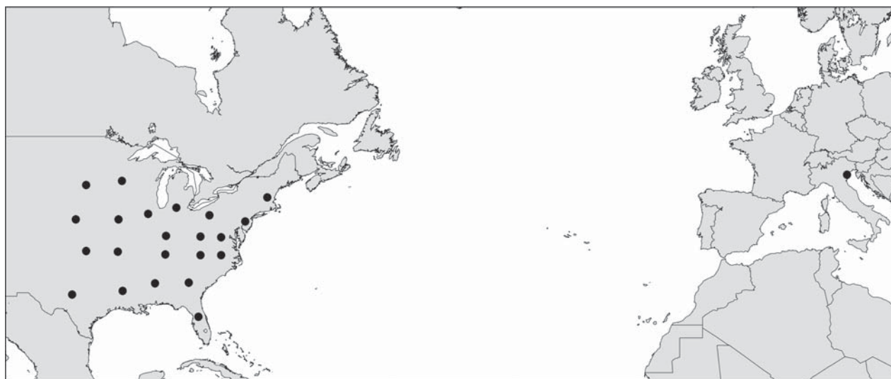
Fig. 1. Distribution map of Acanalonia conica .

are usually small and incapable of threatening cultivated plants. This species is known to be univoltine with eggs laid in the summer and autumn overwintering. Adults in Illinois are present from July to September (Wilson & McPherson 1980b, 1981). Eggs are laid individually inside woody tissue of the plant host. The nymphal stages are brown in colour and have a typical hump-backed shape. They are covered with long white waxy filaments and, like the adults, produce abundant honeydew.