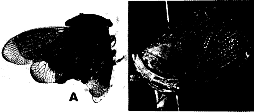
Fig. 1. I. submaculata : (A) dorsal view; (B) anterolateral view (body length = 10 mm; scanning photomicrograph in camera magnification 2X, f8).

Krause. SAN LUIS POTOSI: El Salto, 27-IV-1969 (1♂), coll. Cambell and Bright at blacklight. NICARAGUA: LA CALERA: Managua, 6-IV-1964 (1♀), "en vuelo," coll. Livio Saena M. Specimens are in the collections of L. O'Brien; S. Wilson; Zoologisches Institut und Zoologisches Museum, Hamburg; British Museum (Natural History), London; National Museum of Natural History, Smithsonian Institution, Washington, D.C.; and the Biosystematics Research Institute, Ottawa.