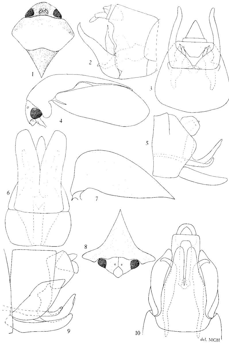
Z. P. Metcalf, Some New Species of Homoptera