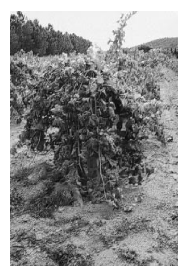
Figure 2 . Symptoms (leaf roll and absence of lignification) caused by phytoplasma infection in cv. Grenache.

Northeast of Region 2 (Catalonia), is of particular concern, because FD phytoplasma is a quarantine organism and is regarded as one of the most destructive vine pathogens. The occurrence of the disease in Spain underlines the importance of starting control measures. Vector populations should be limited, since the leafhopper vector of FD ( S. titanus ) was present in all vineyards sampled (Batlle et al., 1997). The use of clean planting material (Caudwell et al., 1997) and the control of new foci of the disease by surveying GY in neighbouring viticulture areas are measures that should be implemented to contain the disease.