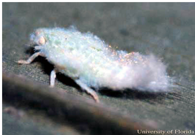
Figure 2. Nymph of Ormenaria rufifascia (Walker), a flatid planthopper.

They drag waxy caudal filaments behind them as they move about the leaf surface.