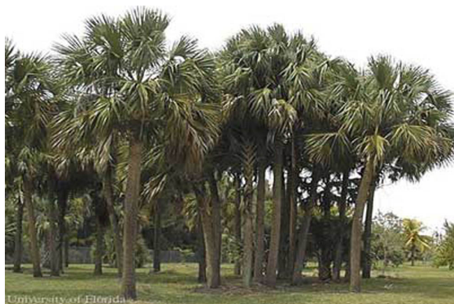
Figure 4. Cabbage palmettos, Sabal palmetto (Walt.) Loddiges. Credits: F. W. Howard, University of Florida

species, nine are native to the Caribbean Floristic Region (which includes Florida), and two are native to the Eastern Hemisphere. The preponderance of American species that serve as hosts may reflect the relatively large proportion of these in landscaped areas and botanical gardens in Florida. The fronds of the different hosts vary in physical characteristics, e.g., color (yellow-green to blue-green and glaucous) and texture of the laminae. The most obvious characteristic common to all is the palmate, rather than pinnate, form of the fronds. Many kinds of insects that occur on palms appear to prefer palms of one or the other of these forms of fronds (Howard et al. 2001).