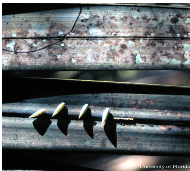
Figure 5. Sooty mold associated with Ormenaria rufifascia (Walker), a flatid planthopper, on a palm frond.

Like the vast majority of species of the insect order Hemiptera, O. rufifascia feeds by sucking plant juices, and thus draws energy from the plant. The populations of this insect usually do not consist of more than several individuals per frond, but dense populations, such as that referred to in the paragraph above undoubtedly consume large quantities of juices over time. As evidence, highly infested fronds are sticky with honeydew and support thick crusts of sooty mold.