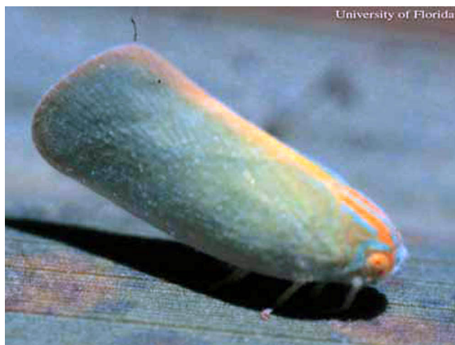
Figure 1. Adult Ormenaria rufifascia (Walker), a flatid planthopper.

They drag waxy caudal filaments behind them as they move about the leaf surface.