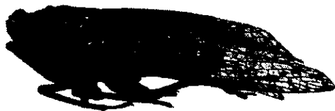
Fig. 2. Calyptoproctus marmoratus Spinola, lateral aspect of specimen from Patrick Co., Virginia. Total length to tips of wings, 18 mm.

Calyptoproctus marmoratus is easily recognized by the combination of its large size (15-20 mm) and color pattern: the forewings have an orange marginal spot at the base, followed immediately by a larger marginal black spot; distal parts of the wings are pale green, irregularly