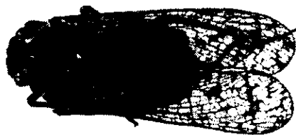
Fig. 3. The same specimen, dorsal aspect to show outline of head and elytral pattern.

marked by small black flecks; the veins are generally black, enclosing clear cells (Figs. 2, 3). As noted, the general body form somewhat resembles that of a small cicada.