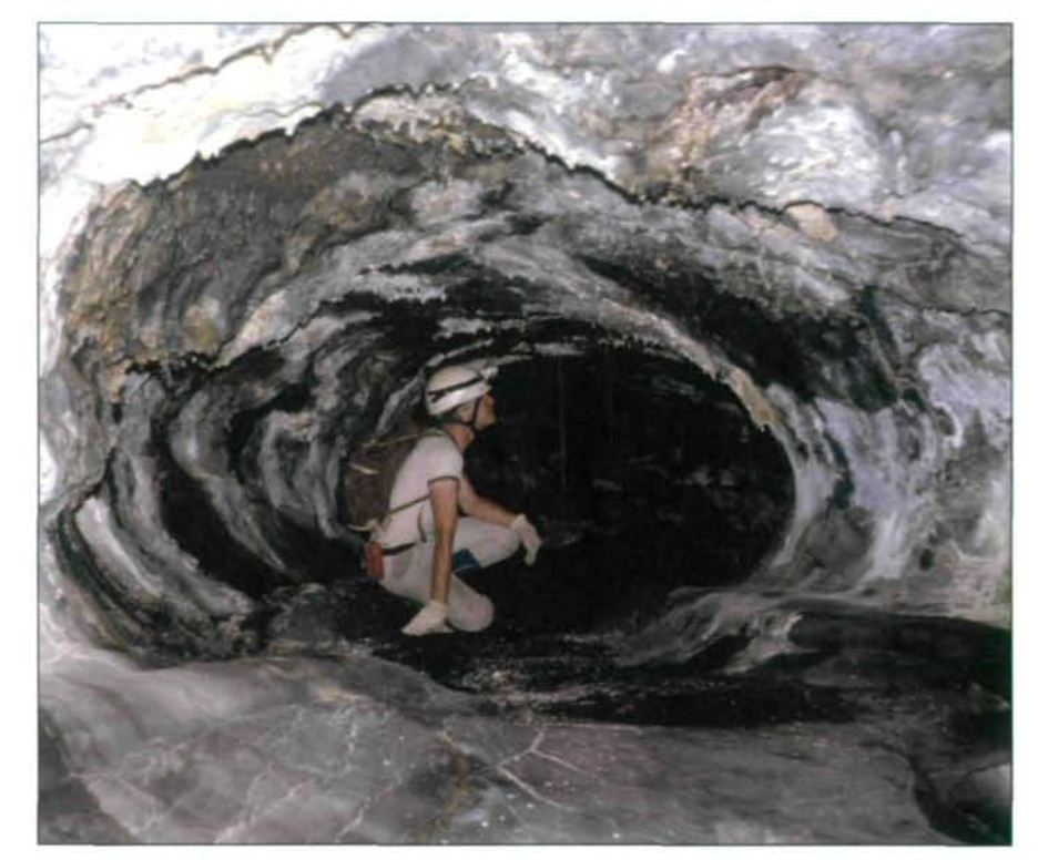
Fig. 5: Lava tube interior

gately cavernicolous Fulgoromorpha species have been found in open lava tubes and limestone caves, may be a collectors' bias, and it is well conceivable that small voids and cracks in the mesocavernous rock system, largely unaccessible to human exploration, are the main habitat, and cave planthoppers only venture into "caves" when the other conditions are replicated (HOWARTH 1983).