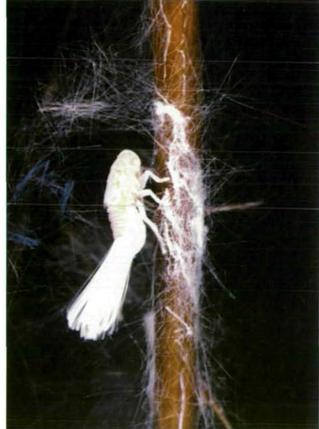
Fig. 2: Oliarus polyphemus, nymph in cocoon on Metrosideros root