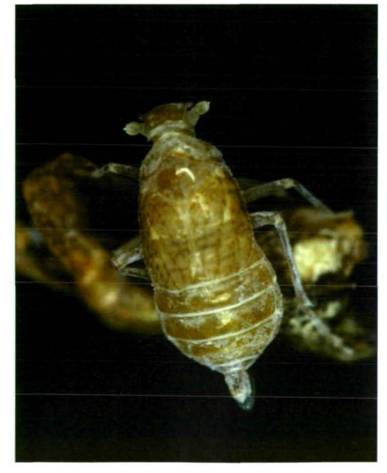
Fig. 8: Tachycixius lavatubus, Canary Islands, habitus

Most of the existing information on the biology and ecology of cavernicolous Fulgoromorpha stems from research on a single taxon: the cixiid genus Oliarus on Hawaii (HOWARTH 1973, 1981; HOCH & HOWARTH 1993, 1999; HOCH & HOWARTH, unpublished data).