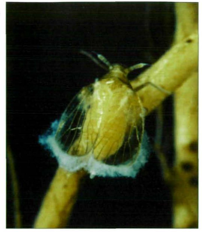
Fig. 7: Solonaima baylissa, Australia, habitus