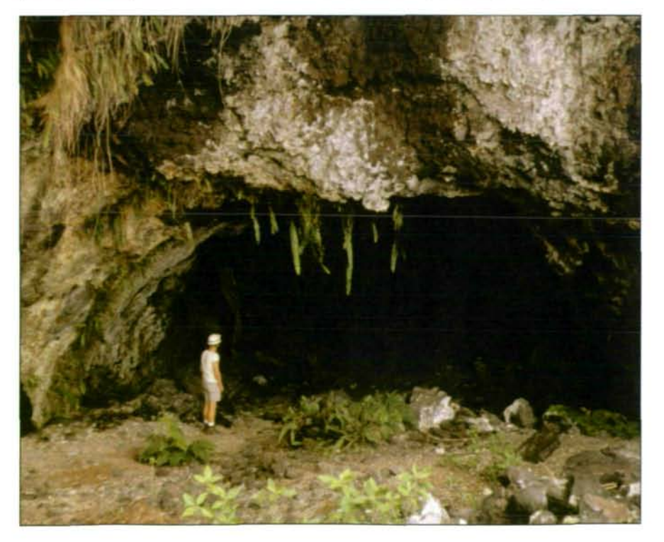
Fig. 4: Entrance of Hawaiian lava tube

time for acquiring cave adaptations. Discoveries of diverse troglobitic arthropod faunas in the tropics, e.g., Australia (Queensland) confirm the predictions, however, vast areas known to contain caves, both in Karst and volcanic regions, remain to be explored (e.g., South America, SE Asia, Africa).