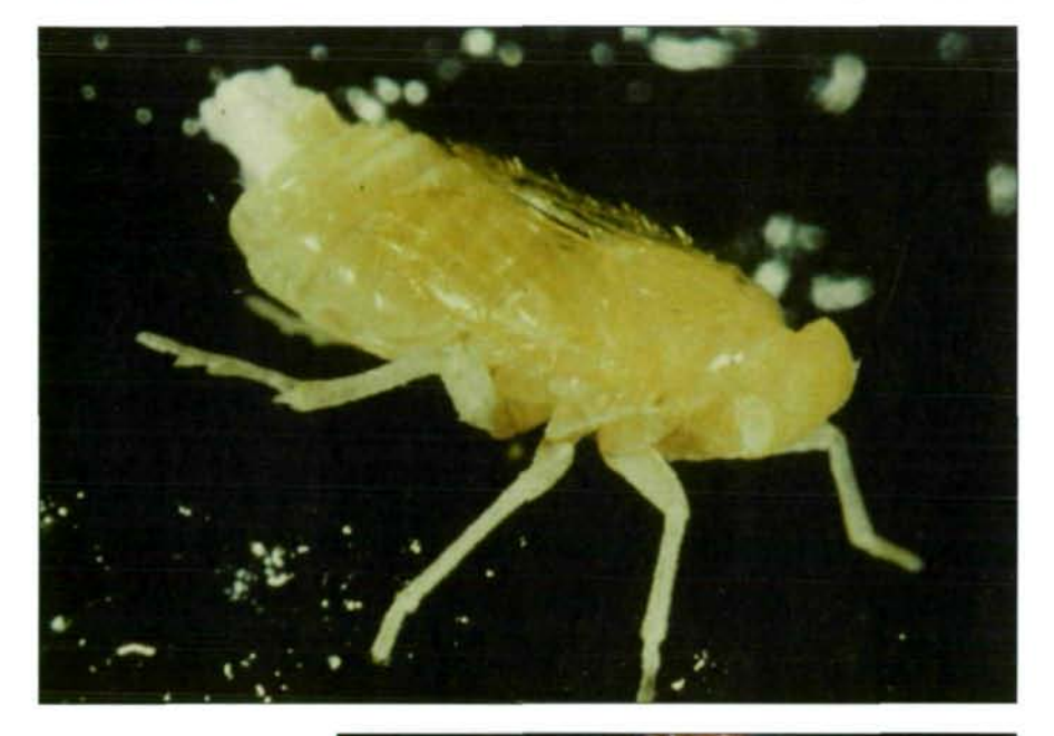
Fig. 1: Oliarus polyphemus, Hawaii, habitus

The first cave-dwelling Auchenorrhyncha species was apparently discovered by RACO-VITZA at the beginning of last century (RACO-VITZA 1907). In this paper, he mentions completely unpigmented nymphs and adults of a "Cixius" species from the Cuevas del Drach on the Balearic Island Mallorca. Unfortunately, this species was never described as a new species. Consequently, it is not mentioned in VANDEL (1965). The author has not been able to track down the original material. 45 years later, a remarkable new fulgoroid species was described from Zimbabwe, Hypochthonella caeca, for which CHINA & FENNAH (1952) established not only a new genus, but erected even a new family, the Hypochthonellidae. It