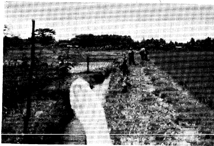
Fig. 2. Irrigated paddy fields at Toril, Davao City. Various stages of the crop are seen.