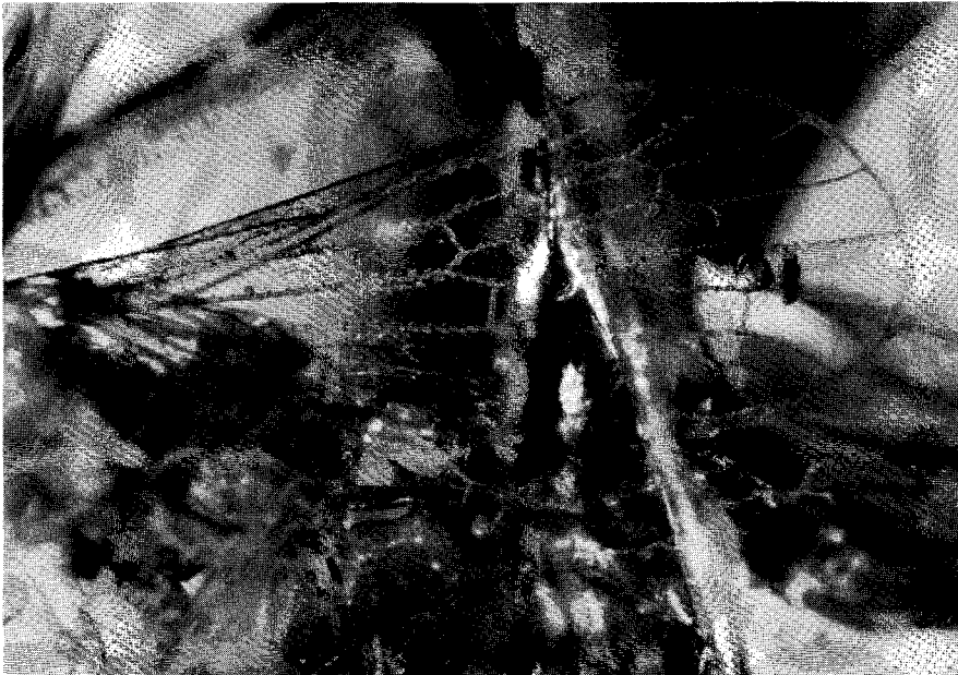
FIG. 12. Mundopoides aptianus tegmen and (upper middle) post-tarsus.