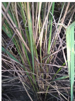
Fig. 2: Some of the stems of the rice plants had turned yellow and dried out