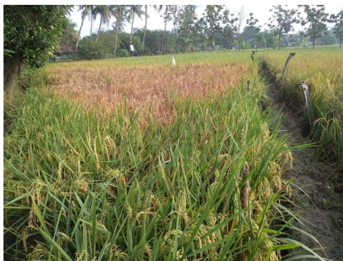
Fig. 1: Condition of rice plants attacked by brown plant-hopper

levels between the lethal thresholds, organized in a geometric sequence, using Eqs. 2 and 3 (Wiratno et al., 2020):