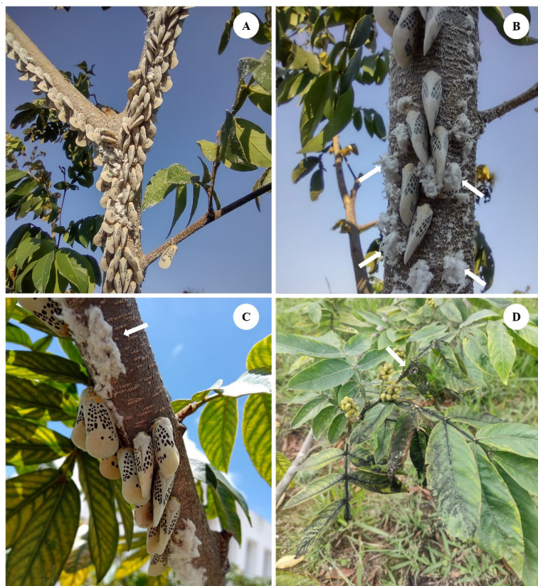
Figure 1. Adults (A); nymphs (indicated by arrows) and adults (B, C) and sooty mold growing up on honeydew produced by adults Poekilloptera phalaenoides on Inga striata plant (D).