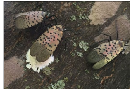
Figure 4. Female spotted lanternfly laying eggs on a trunk. Older egg clusters (tan) are shown left and right; newly laid egg cluster (whitish) is in the middle.