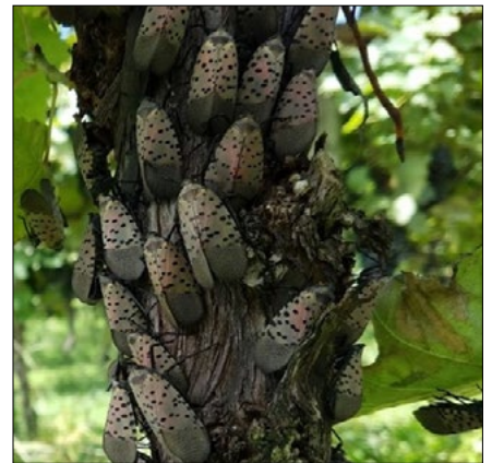
Figure 8. Spotted lanternfly adults aggregating on a grapevine trunk.