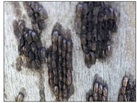
Figure 3. Closeup of spotted lanternfly egg cluster without protective covering.

Head and legs of both sexes are dark brown to black. The unusual short antennae are bulbous, orange and have needlelike tips. Forewings are grayish with black spots; hind wings are banded black and white at the anterior and deep red at the posterior. Tips of the wings show a network of veins. The abdomen is yellowish with incomplete black bands. Leg length is approximately two-thirds inch.