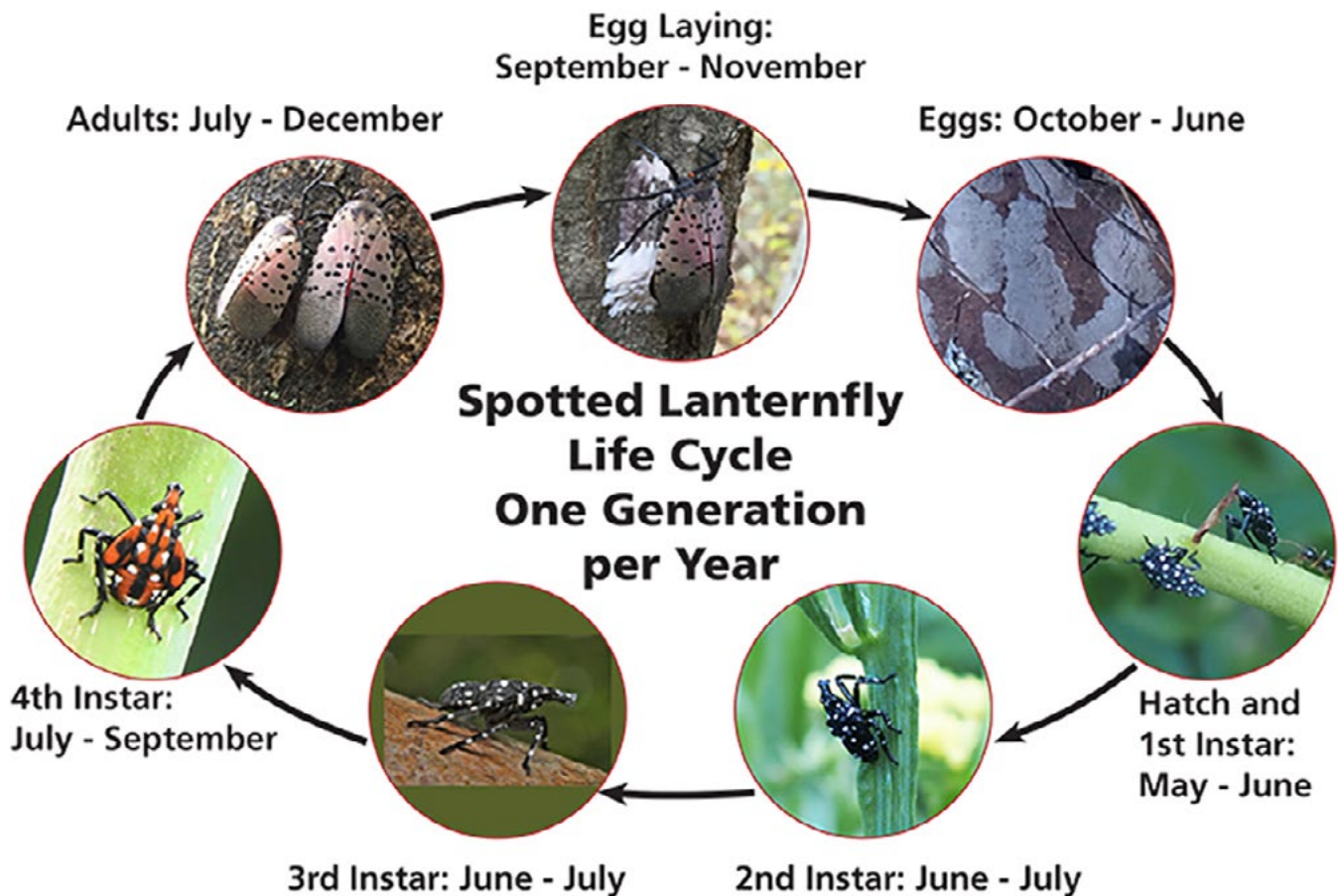
Figure 2. Spotted lanternfly life cycle. There is one generation per year from egg to adult.