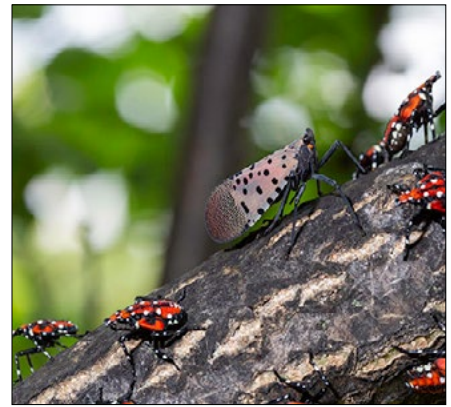
Figure 7. Adults lack visible red areas when wings are closed. Fourth-instar nymphs are also shown resting on a trunk with the adult.