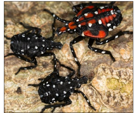
Figure 5. Nymphs (juveniles) of spotted lanternfly. The first through third instar stages are black with white spots (lower left). Fourth-instar nymphs have red coloration with white spots (upper right).