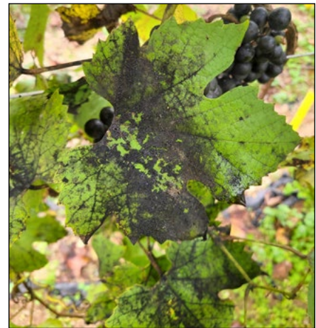
Figure 1. Black sooty mold growing on honeydew secreted by spotted lanternfly while feeding on grapevine.

Feeding can cause the plant to weep or ooze, resulting in fermented sap. The weeping wounds leave a grayish-black trail along the trunk. The insect also secretes large amounts of honeydew, which, together with the