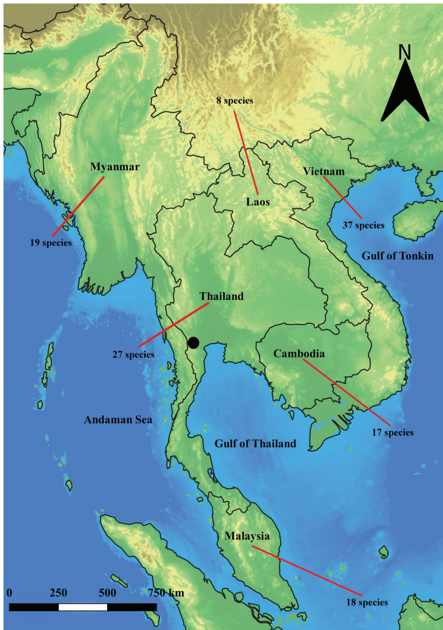
Fig. 3. Fulgoridae diversity in Thailand and neighbouring countries (according to Nagai & Porion, 1996; Bourgoïn, 2021, and present data). ● – Khao Krachom Mountain.