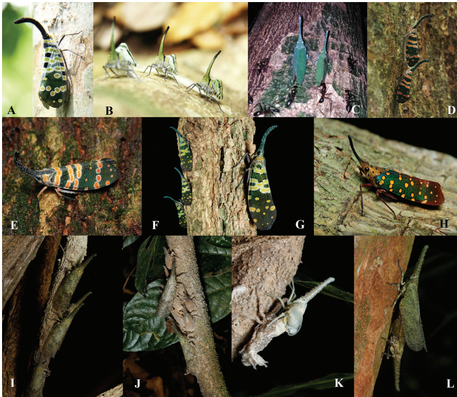
Fig. 2. Lanternflies in nature in Khao Krachom Mountain. A, B – Pyrops connectens , 8.IV 2013; C – Pyrops itoi tended by ants, 27.VII 2020; D, E – Pyrops spinolae on host plant: D – feeding on Pometia pinnata Forst. (Sapindaceae), 5.IX 2017; E – on Balakata baccata (Roxb.) Esser (Euphorbiaceae), 19.VI 2019; F, G – Pyrops viridirostris , 9.VI 2020; H – Saiva gemmata , 20.IV 2020; I–L – Zanna nobilis : I – adults on unidentified vine, 10.II 2020; J – adults and nymphs at night, 10.II 2020; K – molting, 23.II 2020; L – mating, 23.II 2020.