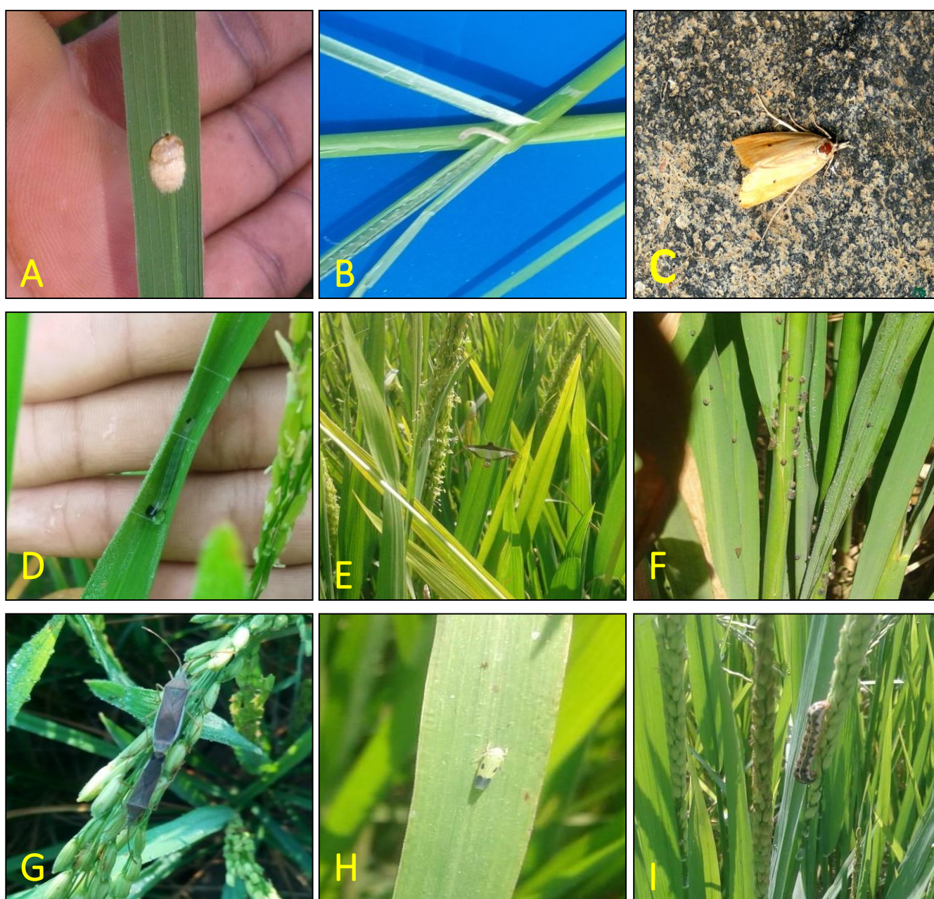
Fig 2: Insects of paddy field at Balaghat district :A :- Eggs of Yellow stem borer, B :- Larva of Yellow stem borer,C :- Adult of Yellow stem borer, D :- Larva of Leaf Folder, E :- Adult of Leaf Folder, F :- Brown Plant Hopper, G :- Gandhi Bug, H :- Green leaf hopper, I :- Larva of Army worm.