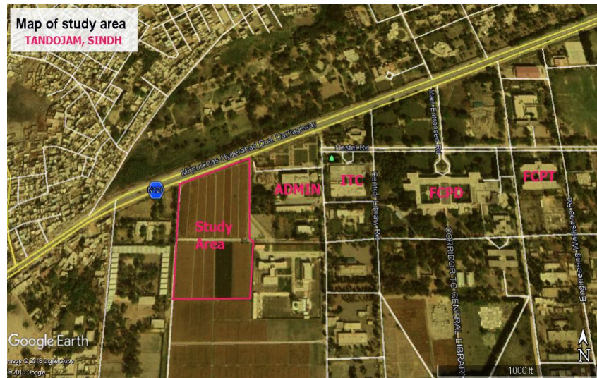
Map of Study Area