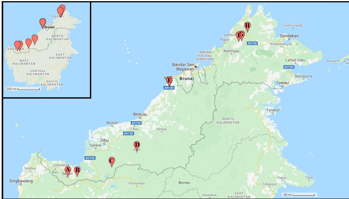
Figure 2. Distribution map of Samsama chersonesia chersonesia : (A) Recreation Park Ranchan, Serian; (B) Sabal Forest Reserve, Simunjan; (C) Lanjak Entimau; (D) Mujong Seringin, Kapit; (E) Lambir Hills National Park, Miri; (F) Denai Laluan Garam, Tambunan; (G) Crocker Range National Park, Tambunan; (H) Poring Hot Spring, Ranau, Malaysian Borneo, based on voucher specimens from UIRC, RDID and SPM