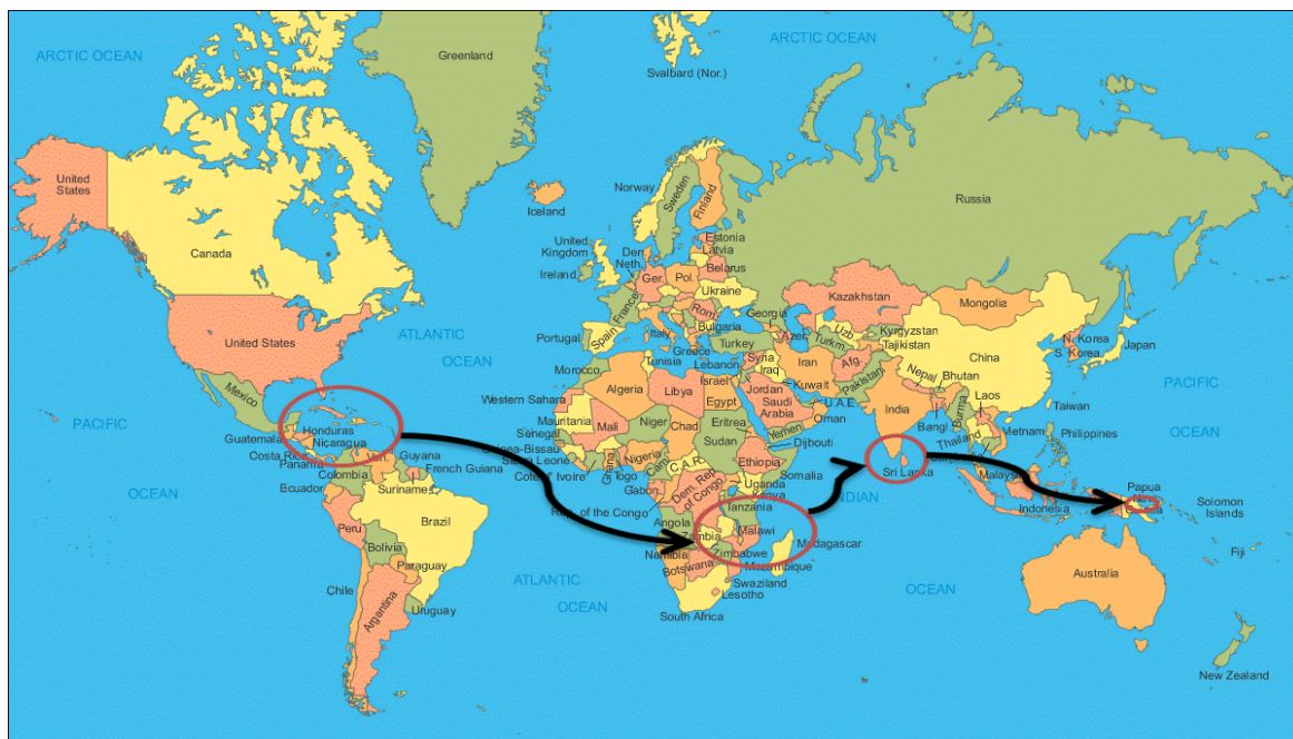
Fig. 3 – Illustration of LYD distribution and sneaky transmission into the Pacific

Chronologically mapping the gradual find of LYD in new locations establishes a plausible pattern for the movement of LYD from the Caribbean to the Americas, then eastwards to Africa and Asia and more recently to the Pacific (PNG). Here the disease is commonly called Bogia Coconut Syndrome (BGS) (Jackson 2017, Gurr et al. 2016). A separate study (Lu et al. 2016) suggests that BGS is caused by a phytoplasma distinct from the coconut lethal yellowing group. Whatever the case, it is surely a major worry for all PICTs that rely heavily on coconut for sustenance and income generation.