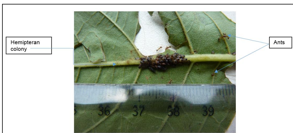
Fig 1: Hemipteran colony benefiting from the presence of ants (Voula Valteri Audrey, 2013)

In the laboratory, evolution of hemipteran colony size with respect to presence or not of ants was observed. With an aid of rearing boxes, hemipterans were isolated and gradually, ants were added until saturation of the milieu. This was to be able to evaluate the survival of these hemipterans in a controlled environment.