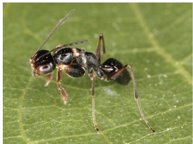
Figure 1. Deinodryinus biroi (Olmi, 1984).