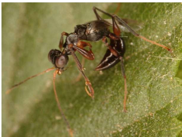
Figure 5. Neodryinus typhlocybae (Ashmead, 1893) – lateral view.