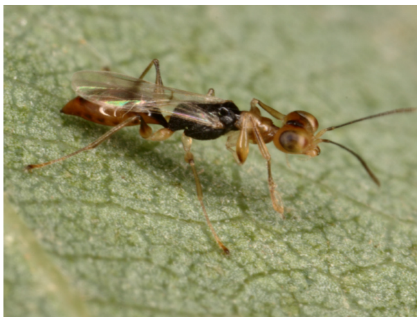
Figure 2. Echthrodelphax italicus Olmi, 1984.

Known hosts: Laodelphax striatella (Fallén), Megadelphax