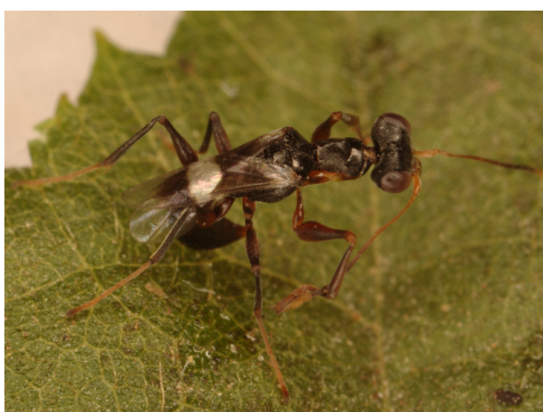
Figure 6. Neodryinus typhlocybae (Ashmead, 1893) – dorsal view.