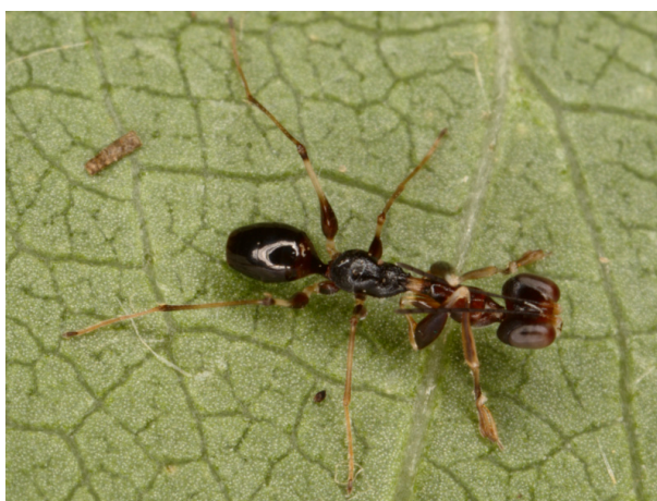
Figure 3. Gonatopus lunatus Klug, 1810.