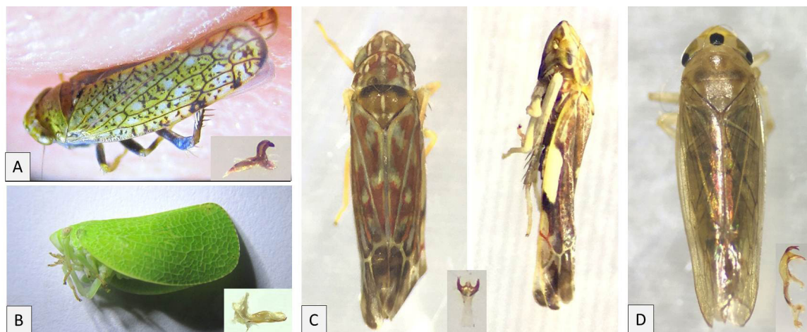
Figure 2. Photographs of alien Auchenorrhyncha species either recorded for the first time in Serbia or confirmed as present: (A) O. ishidiae , aedeagus-lateral view; (B) A. conica , aedeagus-lateral view; (C) E. vulnerata , aedeagus-ventral view and (D) Ph. cyclops , aedeagus-lateral view

12.08.2018; (2) Markovac, along A1 motorway (central Serbia), [44°14'10.6"N 21°07'00.3"E] (EP09), 1♂ swept on Ulmus sp., 27.07.2019; (3) SNR Deliblatska peščara, Kajtasovo, Ludvig polje (Vojvodina, north Serbia) [44°50'27.11"N 21°17'14.33"E] (EQ26), 1♂ 3♀ attracted by a light trap, 29.08.2019.