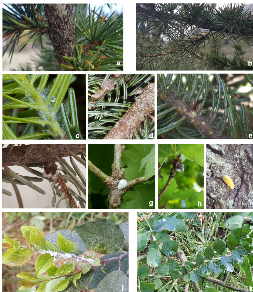
Figure 2. Cinara cedri (a) and its honeydew's drop (b), Schizolachnus pineti (Fabricius) (c), Eulecanium sericeum (d), Nemolecanium abietis (e), Physokermes hellenica (f), Acanthococcus roboris (g), Kermes sp. nr vermillio (h), Marchalina caucasica (i) and nymphs of Metcalfa pruniosa and its honeydew on the leaves (k)

S. pineti is determined on young shoot of fir with honeydew drops (Figure 2c). It is found in Bolu/Aladağ, 40°38'43"N 31°37'36"E, Abies bornmuelleriana , 1360 m, 16.vi.2016; Bolu/Gölcük National Park, 40°36'59"N 31°35'13"E, A. bornmuelleriana , 1230 m, 16.vi.2016; Bolu/Kuzgöl-