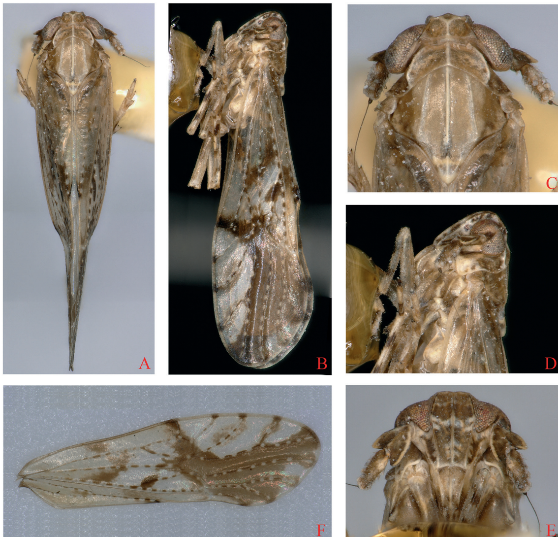
Fig. 3. Neobelocera russa sp. nov., holotype (GUGC-FS-TN-20100801). A. Male habitus, dorsal view. B. Same, lateral view. C. Head and thorax, dorsal view. D. Same, lateral view. E. Face. F. Forewing.

MALE GENITALIA. Anal segment small, ring-like (Fig. 4D). Pygofer in profile much longer ventrally than dorsally (Fig. 4E), in posterior view with opening longer than wide, ventral margin with three medioventral processes, median one longer than lateral ones, truncate apically, lateral ones stout, tapering (Fig. 4D). Aedeagus (Fig. 4F–G) with phallobase, phallus tubular, bent ventrad medially, with node at apex, middle dorsal with a spinous process, directed dorsad, apex with 2 long spinous processes. In addition, 2 processes at subapical part of phallus, right one strongly curved. Phallobase