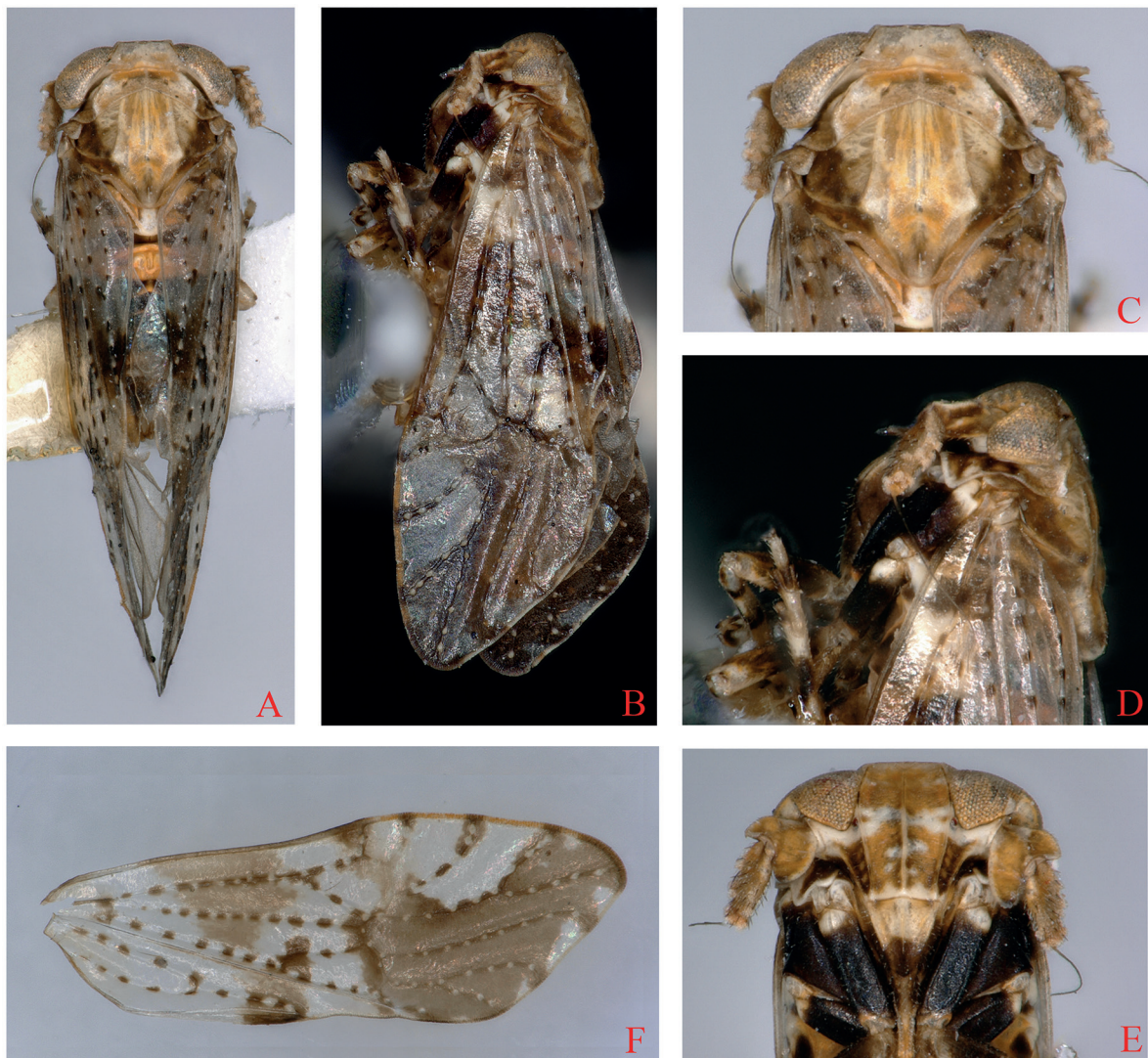
Fig. 1. Neobelocera biprocessa sp. nov., holotype (GUGC-FS-TN-20090401) A. Male habitus, dorsal view. B. Same, lateral view. C. Head and thorax, dorsal view. D. Same, lateral view. E. Face. F. Forewing.

The salient features of the new species include the following: frons with pale transverse band below level of lower margin of eyes (Fig. 2B); antennal segment I subsagittate, markedly flattened, with median longitudinal carina, the ventral apical angle longer than dorsal apical angle (Fig. 2B); ventral margin