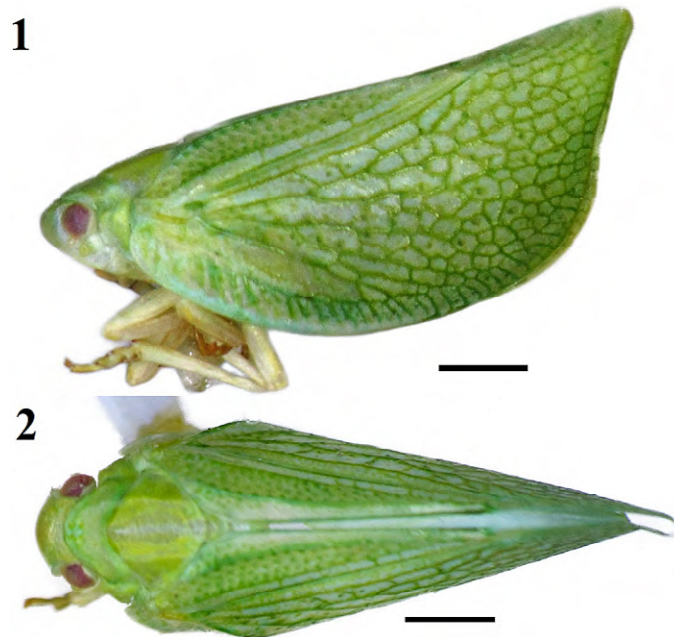
Figures 1, 2. Arelate limbellata , male (Quilpué, fundo El Carmen, Valparaíso Region). 1. Lateral view of the male. 2. Dorsal view of male. Scale bars= 1 mm.

Note. METCALF (1957) places the genus in the subtribe Lawanina Melichar, 1923 of the tribe Flatini Spinola, 1839 (following MELICHAR (1923)); however, MEDLER (1988) excluded Arelate from subtribe Lawanina, being its higher classification not subsequently treated.