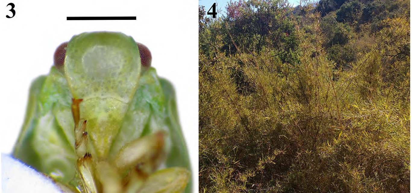
Figures 3, 4. 3. Arelate limbellata , male, ventrocranial view of head (Quilpué, fundo El Carmen, Valparaíso Region, Chile). 4. Chusquea cumingii (Olmué, Valparaíso Region). Scale bar = 1 mm.

Arelate limbellata (Stål, 1854): Figures 1–3