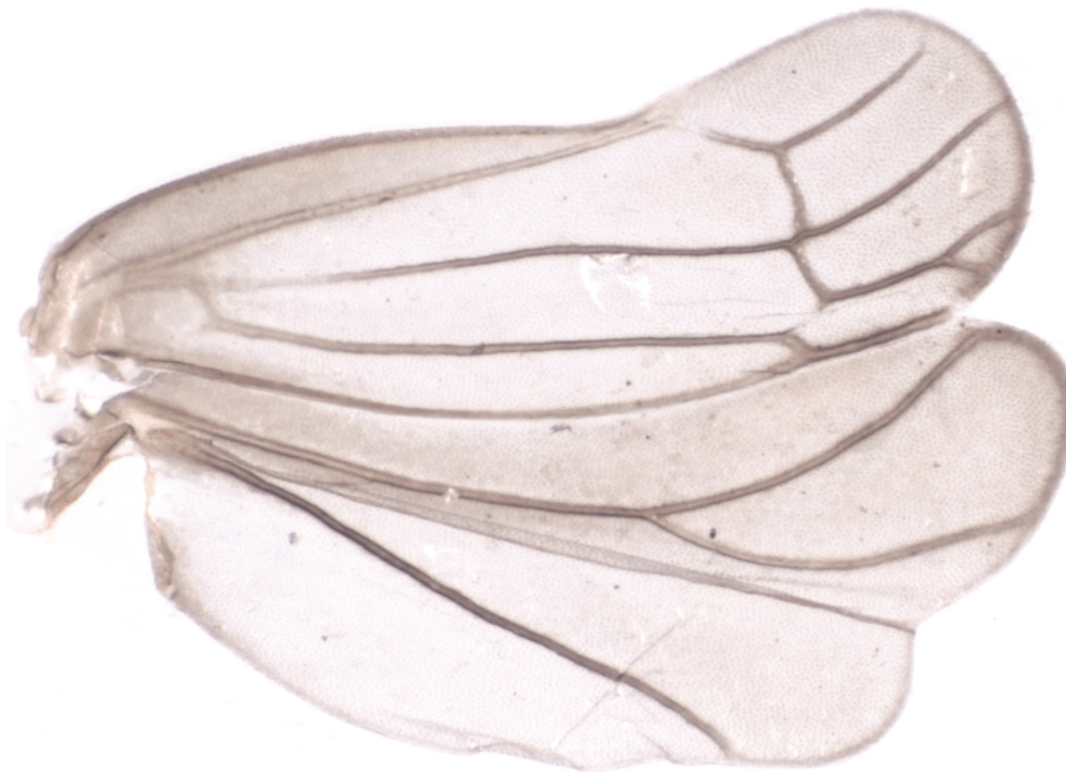
Fig. 1. Euroxenus vayssieres (Bonfils, Attié et Reynaud, 2001), male (La Possession), hind wing.

Diagnosis. Metope with distinct median and sub-lateral carinae joint on its upper margin. Fore wings with R 2–3, M 2–3, CuA 2; without hypocostal plate. Hind wings well developed, 3-lobed, with deep cubital