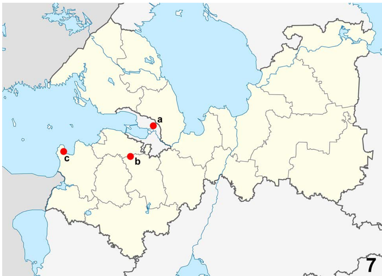
Fig. 7. Distribution of Cixidia confinis (Zetterstedt) in Saint Petersburg and Leningrad Province. a – Sosnovka Park; b – Volkovitsy village; c – Kurgalsky Reserve.

Province, Kingisepp District, nearly 6 km NNW Ust'-Luga, Kurgalsky Reserve, N59°42.229' E28°12.495', 14 May 2019, K.I. Fadeev leg.; numerous larvae, Leningrad Province, Lomonosov District, W of Volkovitsy village, 59°38.435' N 29°47.937'E, 21 May 2019, A.V. Kovalev and A.M. Shapovalov leg.; 1 female, Chuvashiya, 6 km NNW of Cheboksary, left bank of Volga River, August 1996, L. Egorov leg.