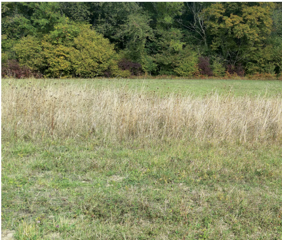
2. Collection site of Tettigometra impressopunctata : De Piepert (province of Limburg), 4.x.2018. 2. Vindplaats van Tettigometra impressopunctata : De Piepert (Limburg), 4.x.2018.

This species is restricted to high quality chalk and limestone grassland and calcareous dunes, typically occurring in fairly short or thin grassy vegetation, often with patches of bare ground or sand. It is usually found in sheltered hollows and on south-facing slopes. In England, the associated vegetation usually contains thyme Thymus and other low calcicoles (Kirby 1992) in addition to grasses. This description of English localities corresponds to the Dutch situation except for the occurrence of thyme. Tettigometra impressopunctata is probably a polyphagous species, but the hostplant(s) are not known (Nickel 2003). Adults are found almost all year round. It is a univoltine species and adults overwinter (Nickel 2003). The overwintering sites are unknown but probably include tussocky vegetation or thick moss layers. All stages appear to spend most of their time on or near the ground. Presumably all central European Tettigometra