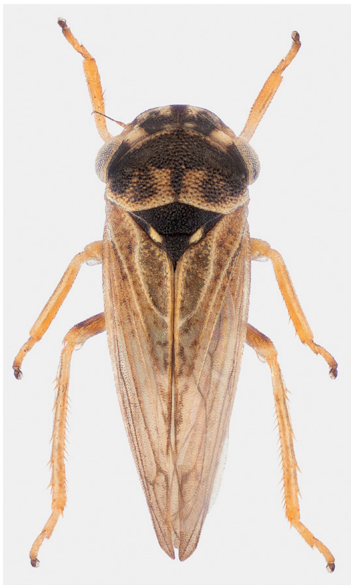
3. Megophthalmus scabripennis ♂, Bedoin (France: Vaucluse), 20.v.2013, genitalia removed. 3. Megophthalmus scabripennis ♂, Bedoin (Frankrijk: Vaucluse), 20.v.2013, genitaliën verwijderd.