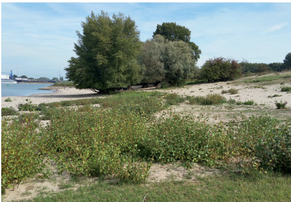
6. Collection site of Kybos abstrusus : Millingerwaard (province of Gelderland), 16.ix.2018. 6. Vindplaats van Kybos abstrusus : Millingerwaard (Gelderland), 16.ix.2018.

Empoasca affinis occurs at sunny sites along forest margins and hedges and at ruderal localities. It is a polyphagous species and adults are found on a number of shrub and tree species ( Carpinus , Corylus , Populus , Rubus , Ulmus , Salix and others) and in the herbaceous vegetation layer. It is often found in low numbers only. In Austria and Germany, there is probably one generation a year and adults hibernate (Holzinger 2009, Nickel 2003).