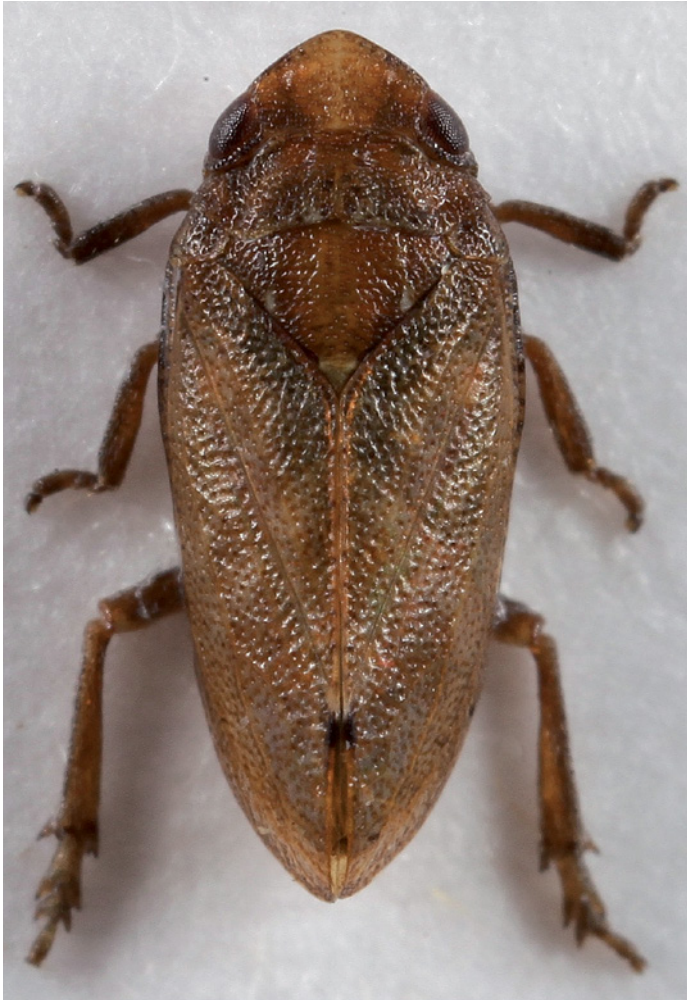
1. Tettigometra impressopunctata ♀, De Piepert (province of Limburg), 9.ix.2018. 1. Tettigometra impressopunctata ♀, De Piepert (Limburg), 9.ix.2018.

variation in head shape and body colouration (Holzinger et al. 2003, Nickel 2003).