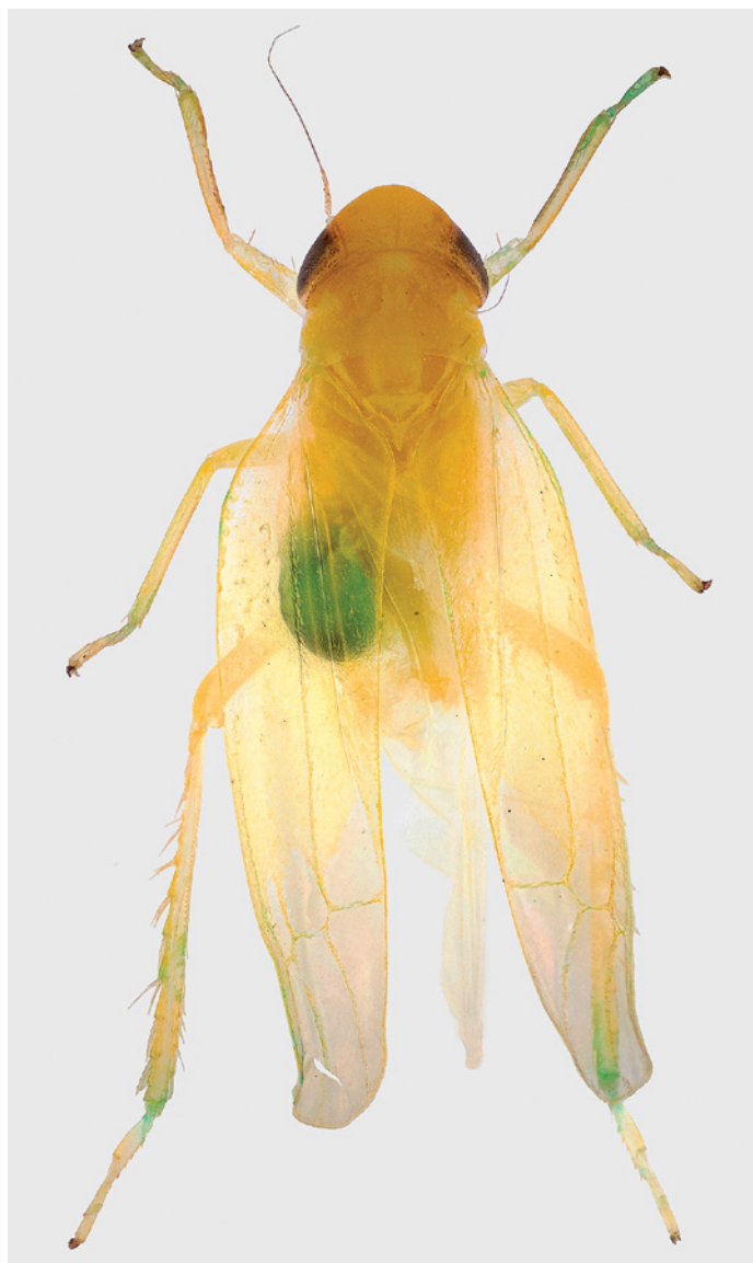
4. Empoasca affinis ♂, 1 km nw Eys (province of Limburg), 4.x.2018, genitalia removed. 4. Empoasca affinis ♂, 1 km nw Eys ( Limburg), 4.x.2018, genitaliën verwijderd.

species are associated with ants but the character of this relationship is not well understood (Lehouck et al. 2004, Nickel 2003).