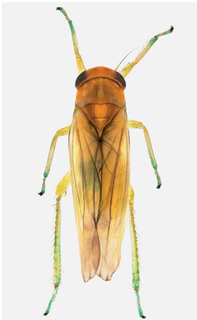
Kybos abstrusus (figure 5)

Material Province of Gelderland: nature reserve Millingerwaard, 1.5 km nw Kekeerdom (AC 196.5-431.4), larvae were also observed on seedlings of Populus nigra on the sand bank of the river Waal, 24.viii.2017, 3 ♂♂, 1 ♀, leg. & coll. M. de Haas; same locality and hostplant, 16.ix.2018, 3 ♂♂, 11 ♀♀, leg. & coll. C.F.M. den Bieman (figure 6).