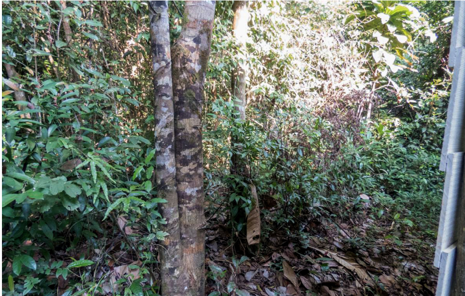
Fig. 4. Sogana chartieri sp. nov., habitat in Tatai.

DISTRIBUTION. Cambodia: Koh Kong Province (Fig. 5).