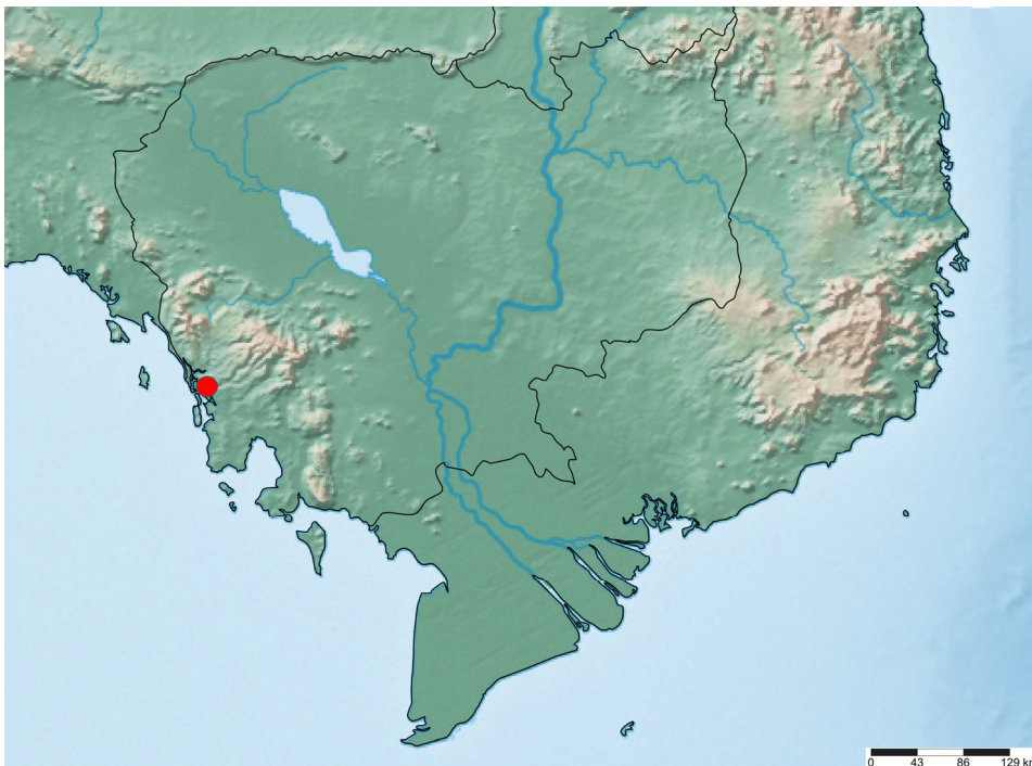
Fig. 5. Sogana chartieri sp. nov., distribution map.