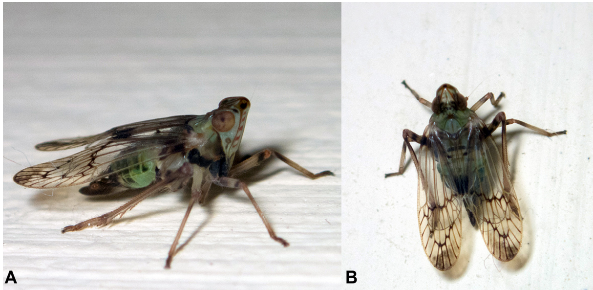
Fig. 3. Sogana chartieri sp. nov., holotype ♂ in Tatai, 6.IX.2016. A, lateral view. B, dorsal view.

Thorax: (Fig. 1 A–D, G–I) pronotum pale yellow-brown with irregular brown spots on disc, black impressed point on disc, on each side of median carina and brown patch along anterior margin of lateroventral lobes; posterior margin emarginate; median carina weakening near anterior margin. Mesonotum pale yellow-brown with median and discal carinae joining anteriorly and 4 brownish spots along posterior margin; scutellum slightly darker. Tegulae pale yellow-brown. Lateral pleura of prothorax with black band prolongating the black area on sides of clypeus. Lateral pleura of metathorax with brown markings.