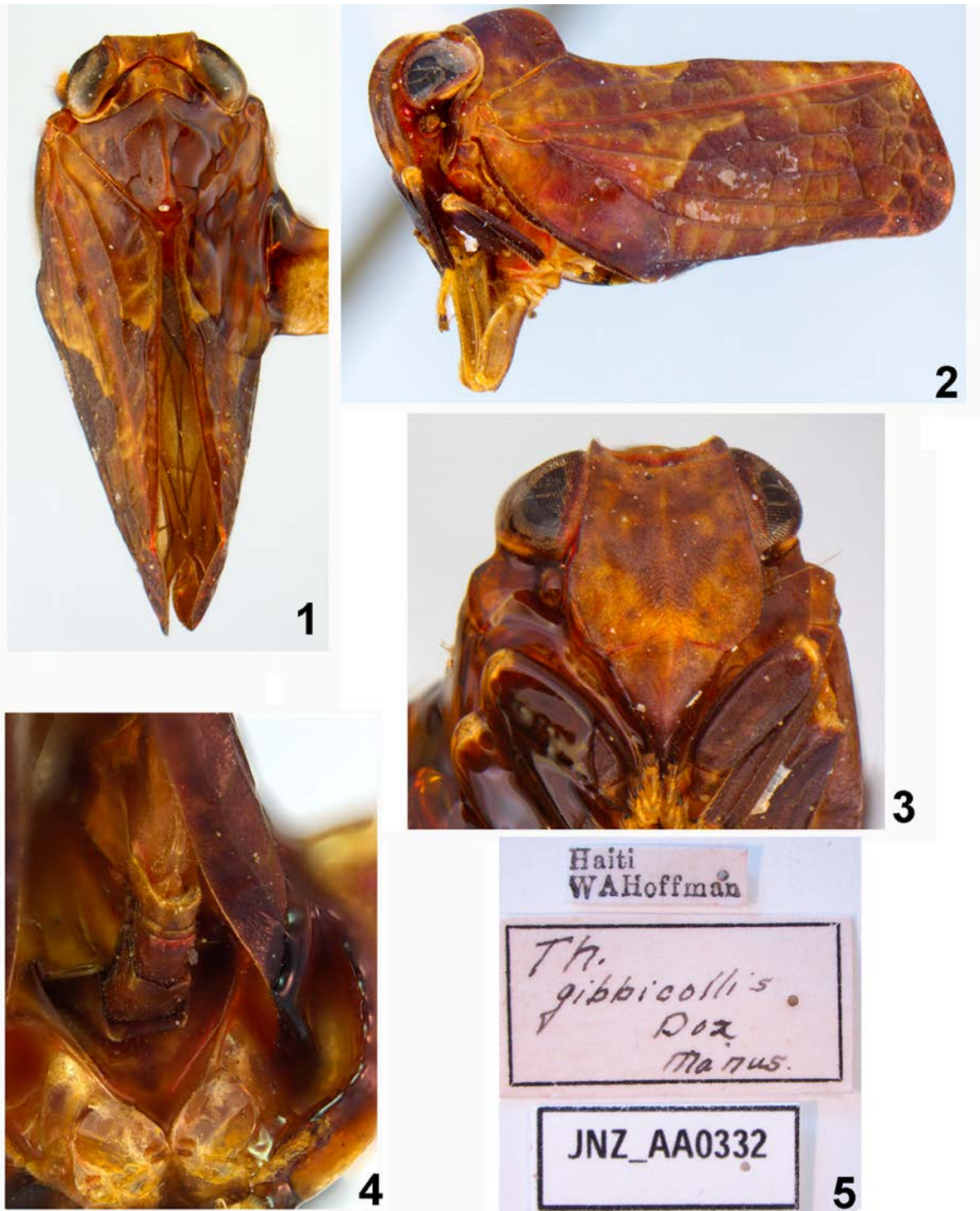
Figs 1–5. Dozierana gibbicollis (Dozier), male paratype. 1 – dorsal view, 2 – lateral view, 3 – face, 4 – abdomen, ventral view, 5 – labels.