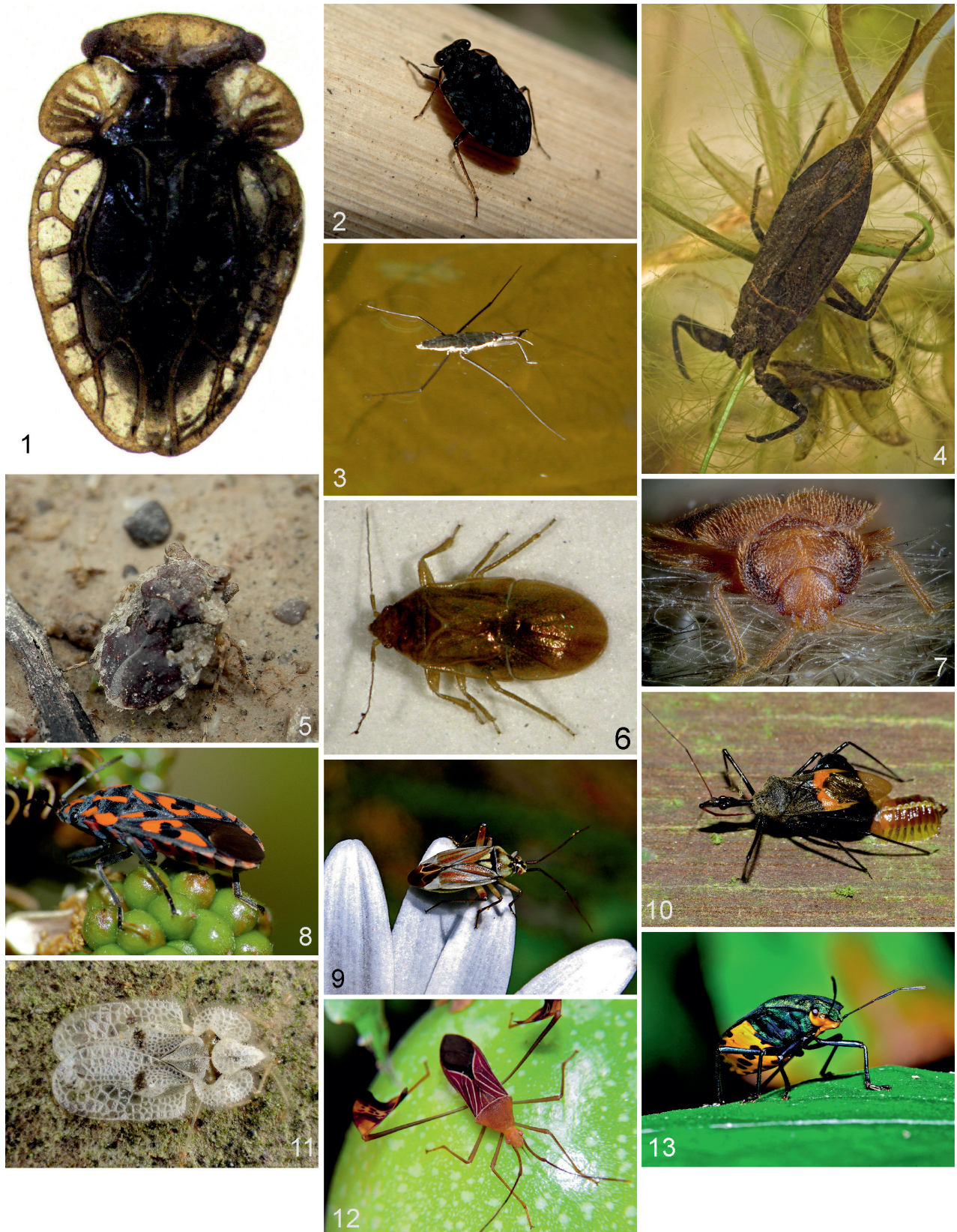
Plate 2 Diversity of the Hemiptera. (1) Moss bug Xenophyes rhachilophus (Peloridiidae). Photo: S. E. Thorpe, public domain. (2) Ochterus marginatus (Ochteridae), public domain. (3) Water strider (Gerridae). Photo: Ryan Hodnett, CC BY-SA 4.0. (4) Nepa rubra (Nepidae). Photo: Holger Gröschl, CC BY-SA 2.0. (5) Big-eyed toad bug Gelastocoris oculatus (Gelastocoridae). Photo: Ryan Hodnett, CC BY-SA 4.0. (6) Cryptostemma sp., female (Dipsocoridae). Photo: Michael F. Schönlitzer, CC BY-SA 3.0. (7) Female of bed bug Cimex lectularius (Cimicidae), on the fur of one of its hosts, a bat. Photo: Jacopo Werther, CC BY-SA 4.0. (8) Checkerboard ground bug Spilostethus saxatilis (Lygaeidae). Photo: Bernard Dupont, CC BY-SA 2.0. (9) Plant bug Calocoris roseomaculatus (Miridae). Photo: Hectonichus, CC BY-SA 3.0. (10) Assassin bug (Reduviidae), female laying eggs. Photo: Bernard Dupont, CC BY-SA 2.0; (11) Sycamore lace bug Corythucha ciliata (Tingidae). Photo: Jacopo Werther, CC BY-SA 2.0. (12) Flag-footed bug Anisoscelis affinis (Coreidae). Photo: Cheryl Harleston, CC BY-NC-SA 4.0. (13) Shield-backed bug (Scutelleridae). Photo: Bernard Dupont, CC BY-SA 2.0.