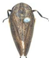
Poophilus costalis (Walker)