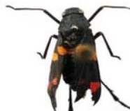
Callitettix varicolor (Fabricius)