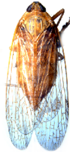
Dictyopharina viridissima Melich.