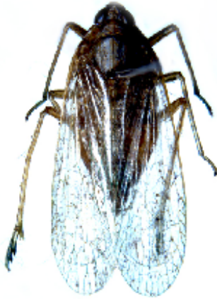
Dictyopharina consanguinea Dist.