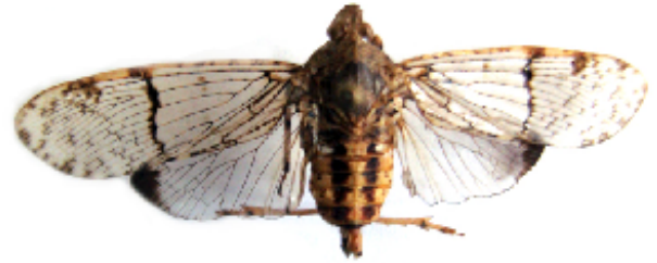
Dichoptera hyalinata (Fabricius)