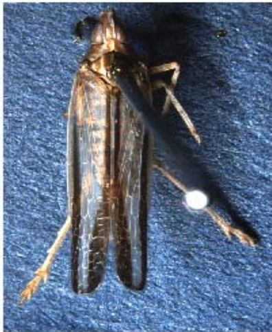
Dictyophora lineata Don.