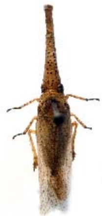
Zanna chinensis Dist.