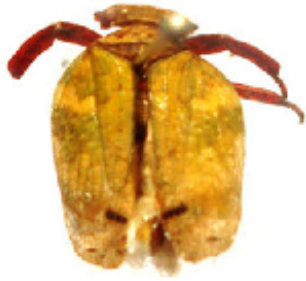
Furrybrachys tomentosa (Fabricius)