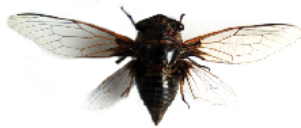
Cryptomyzomena intermedia (Sign.)