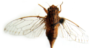
Rustia tigrina Dist.