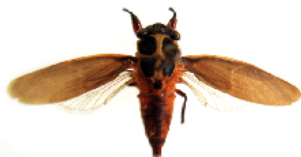
Scieroptera splendidula (Fabr.)