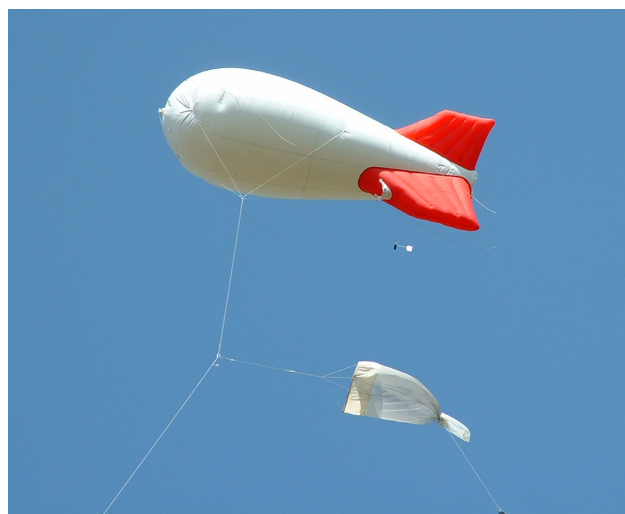
Fig. 1. Sampling insects at ca. 200 m above ground by means of a net attached to the tethering line of a 6-m long kytoon. The detachable bag at the end of the net has just been closed-off, prior to winching down of the kytoon to ground level and recovery of the sample. The wind-run meter can be seen suspended below the kytoon tail.

We took aerial samples of insects at ca. 200 m above ground with a drogue net of 1 m diameter aperture suspended from a tethered helium-filled kite-balloon (kytoon) (Fig. 1). The sampling site, at Cardington Airfield (52°06'N, 0°25'W), Shortstown, Bedfordshire, in southern England, has an official aircraft exclusion zone which allowed the kytoon to be flown above the Civil Aviation Authority limit of 60 m. Sampling was carried out in the years 1999, 2000, and 2002–2007, in various months between May and early September, but mostly in July (Table 1). [The aerial netting was designed to support our radar observations (e.g. Hu et al., 2016), and insect numbers detected by the radar were extremely low outside the May–September period.]