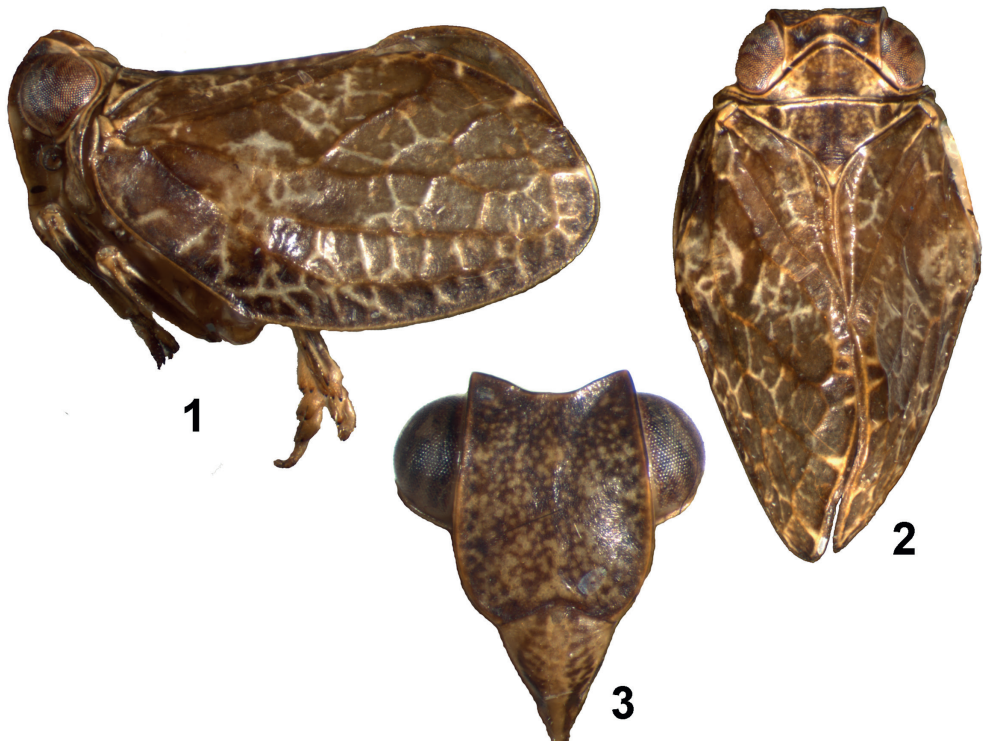
Figs 1–3. Sarnus rhomboidalis Fennah (Madagascar). 1, body, lateral view; 2, body, dorsal view; 3, head, frontal view.

Supplementary description (based on Madagascan specimen). Metope elongate, slightly convex, with weakly convex lateral margins and without median and sublateral carinae (Fig. 3). Upper margin of metope angularly concave. Metopoclypeal suture groove-shaped. Postclypeus without carina. No ocelli. Coryphe short, transverse (at least 0.2 times as long medially as wide), without carina, its anterior margin distinctly convex, posterior margin strongly concave (in dorsal view) (Fig. 2). Pedicel short, rounded. Pronotum without carina, anterior margin strongly convex, posterior margin straight. Paradiscal fields of pronotum very narrow behind eyes. Paranotal lobes of pronotum