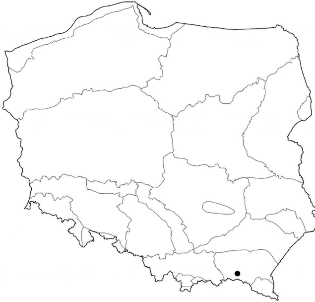
Fig. 1. Location of collection site of R. quinquecostatus .

Ryc. 1. Lokalizacja miejsca odłowu R. quinquecostatus .