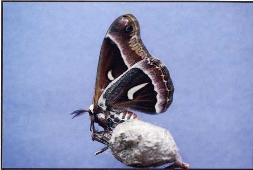
Figure 22 —Adult male ceanothus silk moth, Hyalophora euryalus (Boisduval) (Lepidoptera: Saturniidae), on top of its cocoon soon after emergence.