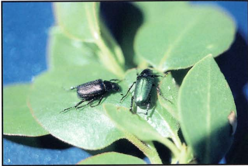
Figure 14 —Two color variants of the ubiquitous scarab Dichelonyx backi (Kirby) (Coleoptera: Scarabaeidae). Adults were commonly encountered feeding on greenleaf manzanita leaves making characteristic small notches on leaf edges.