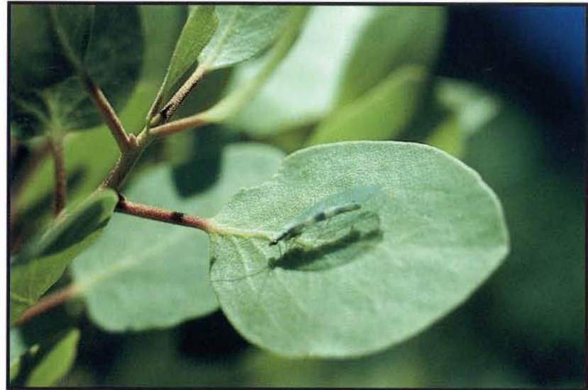
Figure 26 —Green lacewing adult (Neuroptera: Chrysopidae).