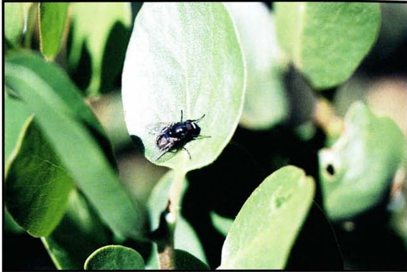
Figure 34 —Adult muscid fly (Diptera: Muscidae) (larvae are scavengers).

basic biological information about insect fauna associated with greenleaf manzanita that can be used in future studies. For example, a portion of the herbivorous insects encountered in this study have the potential to cause serious damage to greenleaf manzanita plants after they are released from their natural regulating agents. If this release can be accomplished on a large scale, it represents an ecologically sound method of altering vegetation composition to favor more desirable plant species such as high-value conifers.