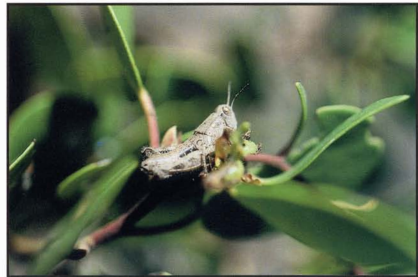
Figure 13 —Grasshoppers, such as this immature Melanoplus sp. (Orthoptera: Acrididae), are quite common in greenleaf manzanita brushfields.

Perhaps the most important natural enemies of greenleaf manzanita are the defoliators, defined here as those insects that possess chewing mouthparts. Damage can be severe because entire leaves can potentially be removed in a relatively short time period by a single insect. Greenleaf manzanita defoliators belong to one of three insect orders; Orthoptera, Coleoptera, or Lepidoptera. Grasshoppers (fig. 13) and katydids (Orthoptera) were often common as were members of several beetle (Coleoptera) families including scarabs (Scarabaeidae) (fig. 14), leaf beetles (Chrysomelidae), and weevils (Curculionidae). Lepidoptera (moths and butterflies), however, were the most common defoliators encountered. This group of insects is represented by numerous families and species (Valenti and Zack 1995) (figs. 15-24).