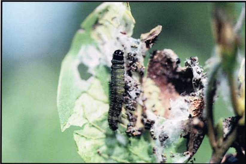
Figure 6 — Choristoneura sp., rosaceana (Harris) complex (Lepidoptera: Tortricidae) larva in an unraveled leaf bundle. This species generally completes its larval development before new leaves expand in the late spring and pupation occurs within a loose silken cocoon inside the tied leaf bundle. Damage can be locally severe.