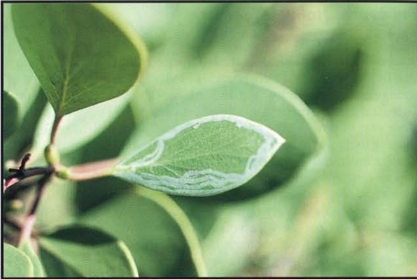
Figure 7 —Serpentine mine caused by an undetermined species (Lepidoptera: Gracillariidae).