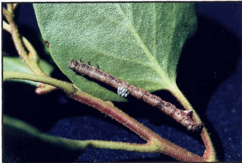
Figure 33—Fifth larval instar of Synaxis cervinaria (Packard) (Lepidoptera: Geometridae) being parasitized by Euplectrus sp., possibly plathypenae Howard (Hymenoptera: Eulophidae).

coprophagous forms. Detritivores feed on dead organic material and were common. Representatives of three families of springtails (Colembola: Isotomidae, Entomobryidae, and Sminthuridae), one family of jumping bristletails (Microcoryphia: Machilidae), a stag beetle (Coleoptera: Lucanidae), crane flies (Diptera: Tipulidae), and a lauxaniid fly (Diptera: Lauxaniidae) were encountered. Coprophagous forms feed on dung and are also decomposers and are represented by two scarab beetles (Coleoptera: Scarabaeidae). The majority of scavengers collected, such as muscid flies (fig. 34), feed on a variety of waste materials and all play an important role in decomposition and mineral recycling.