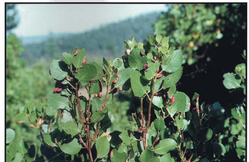
Figure 10 —Greenleaf manzanita plant infested with leaf galls caused by the manzanita leaf gall aphid, Tamalia coweni (Cockerell) (Homoptera: Aphididae). Emerging alate forms are sexual winged males and females which mate and produce eggs that overwinter.