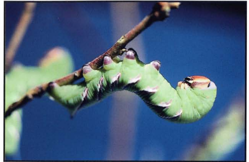
Figure 23 —A hawk moth larva, Sphinx vashti Strecker (Lepidoptera: Sphingidae).