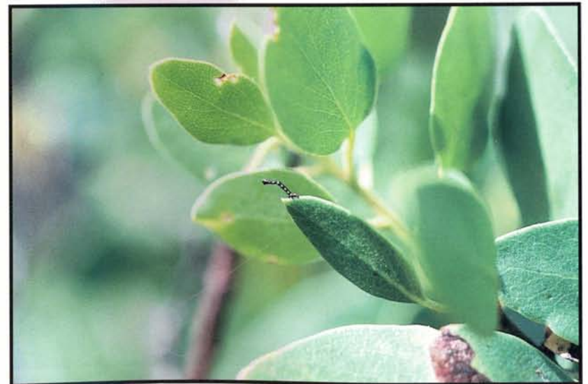
Figure 17 —Early larval instar of Aethaloida packardaria (Hulst) (Lepidoptera: Geometridae) in a typical resting posture on the edge of a leaf.