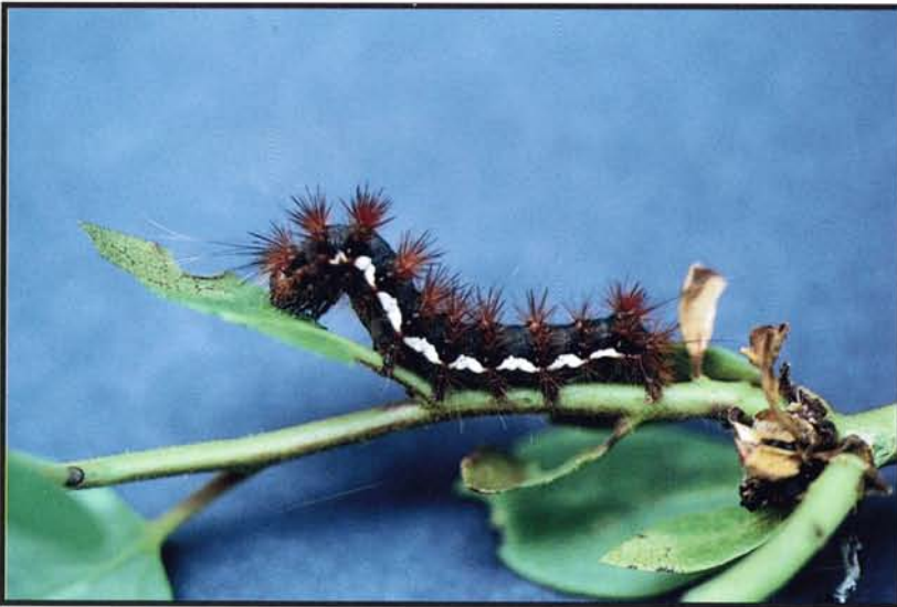
Figure 24 —An unusual noctuid larva, Acrionicta perdita Grote (Lepidoptera: Noctuidae).