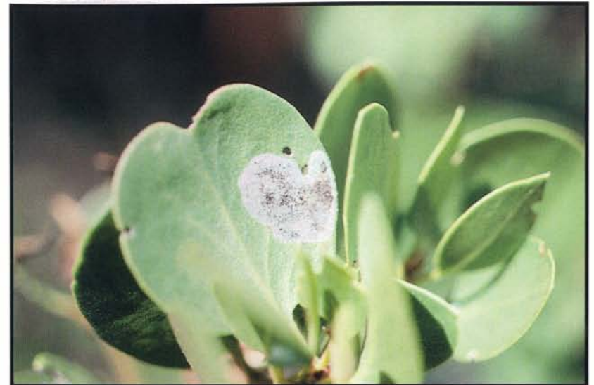
Figure 8 —Blotch mine caused by an undetermined species (Lepidoptera: Gracillariidae).