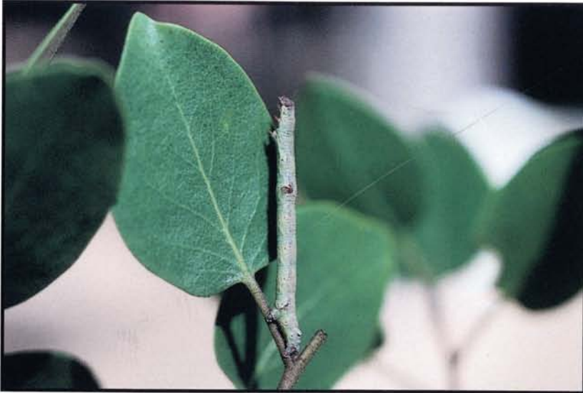
Figure 18 —Green larval color variant of Hesperumia fumosaria impensa Rindge (Lepidoptera: Geometridae) that mimics newly expanding manzanita shoots. A second crimson larval color variant of this species occurs concurrently and mimics mature manzanita stems. Larvae feed on previous years' leaves and complete development by late spring generally before new leaves mature. Pupation occurs in the leaf litter and adults are active during June and July. Eggs deposited in litter overwinter.