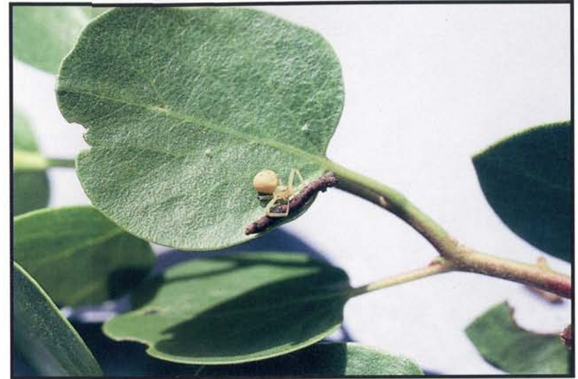
Figure 29 —Unidentified crab spider (Araneae: Thomisidae) feeding on a larva of Synaxis cervinaria (Packard) (Lepidoptera: Geometridae).