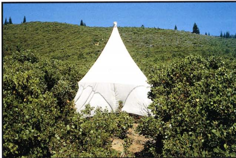
Figure 3 —Malaise trap used to collect flying insects at the Logan Lake site. Insects fly into and land on the sides of the trap and crawl upwards becoming trapped in a container at the top.

either pinned or preserved in alcohol and labelled with complete collecting information. Specimens were sent to various taxonomic experts for positive identification. The ecological role of each taxon (i.e., how it functions in the manzanita community) was determined by direct observations and rearings, or inferred from related species by consulting general entomological references (e.g., Borror and others 1989, Essig 1958, Powell and Hogue 1979). Unless otherwise indicated, voucher specimens are now stored in the Maurice T. James Entomological Museum, Department of Entomology, Washington State University, Pullman.