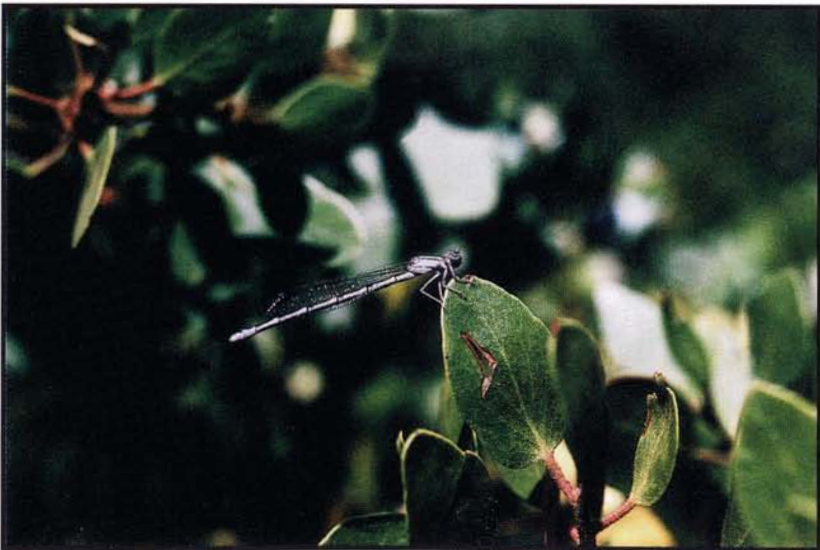
Figure 27 —Damselfly (Odonata) adult resting on a greenleaf manzanita leaf.

The most important invertebrate predators were ants (Hymenoptera: Formicidae). Ants were commonly encountered at all study sites, both on the ground and on greenleaf manzanita plants. Most ant species are generalist predators and numerous studies have shown them to be very important in regulating many insect populations (Finnegan 1971, Laine and Niemelä 1980, Youngs 1983, Valenti and others 1998).