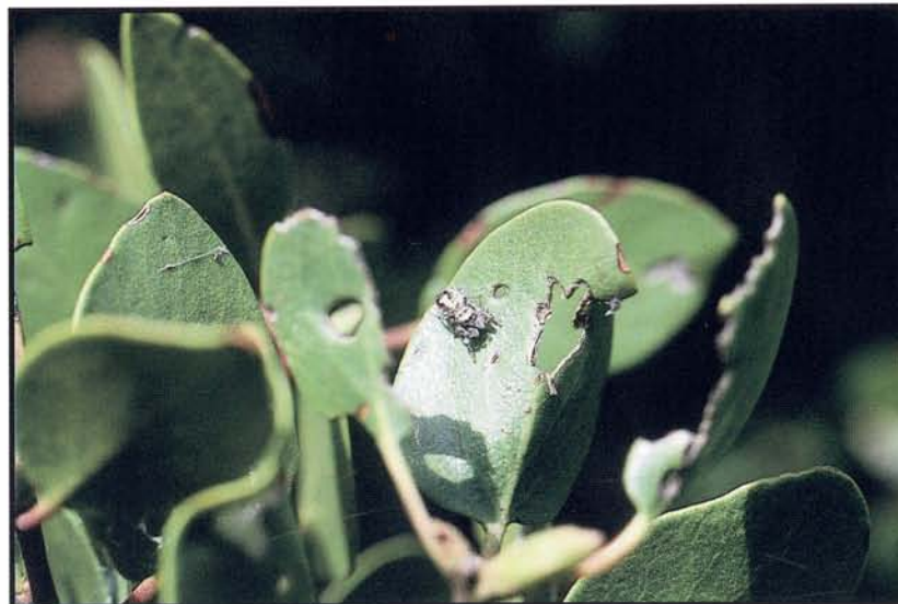
Figure 30 —Unidentified jumping spider (Araneae: Salticidae).

were encountered in greenleaf manzanita brushfields. These included a tick (Acari: Ixodidae), two black flies (Diptera: Simuliidae), a midge (Diptera: Chironomidae), and four deer flies (Diptera: Tabanidae). Seventy-nine parasitoids were collected from two orders and 19 families, many of which we reared from known hosts (table 1).