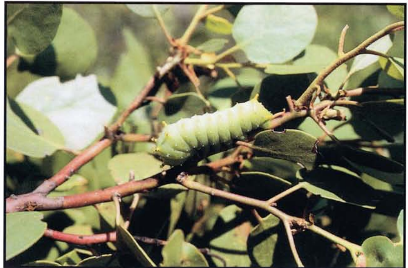
Figure 21 —Mature larva of the ceanothus silk moth, Hyalophora euryalus (Boisduval) (Lepidoptera: Saturniidae).