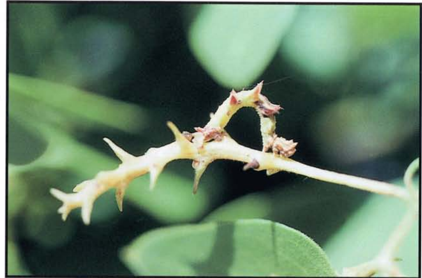
Figure 19 —An unusual greenleaf manzanita inflorescence mimic, Nemoria glaucomarginaria (Barnes & McDunnough) (Lepidoptera: Geometridae).