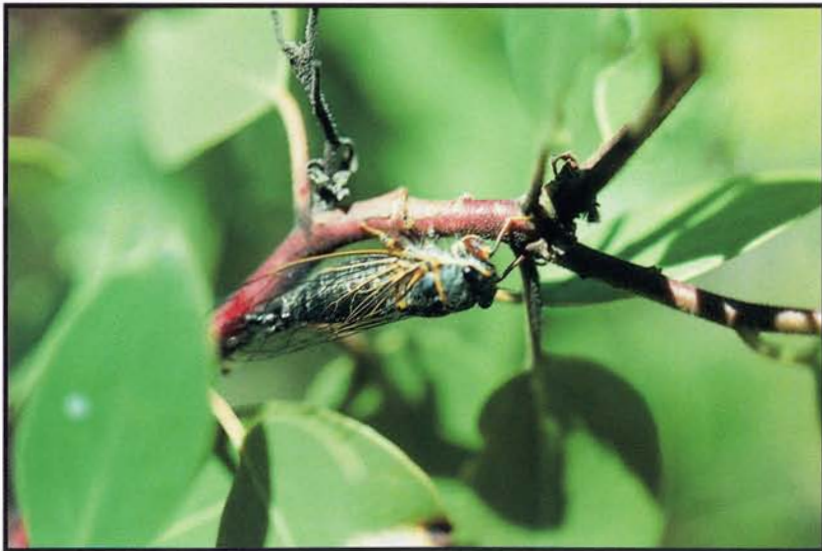
Figure 12 —Adult cicada, Platypedia putnami (Uhler) (Homoptera: Cicadidae), resting on a greenleaf manzanita branch. In 1993 adult females were commonly encountered at the Hat Creek site notching and depositing eggs in greenleaf manzanita branches.

sap, usually from leaves. This type of feeding produces a necrotic stippling effect and, if severe enough, can cause serious damage to leaf tissue. Aphids (Homoptera: Aphididae) and leafhoppers (Homoptera: Cicadellidae) were common on greenleaf manzanita foliage during the growing season (fig. 11). Cicada adults (Homoptera: Cicadidae) periodically were locally abundant (fig. 12). Females oviposited in greenleaf manzanita stems but feeding was not observed.