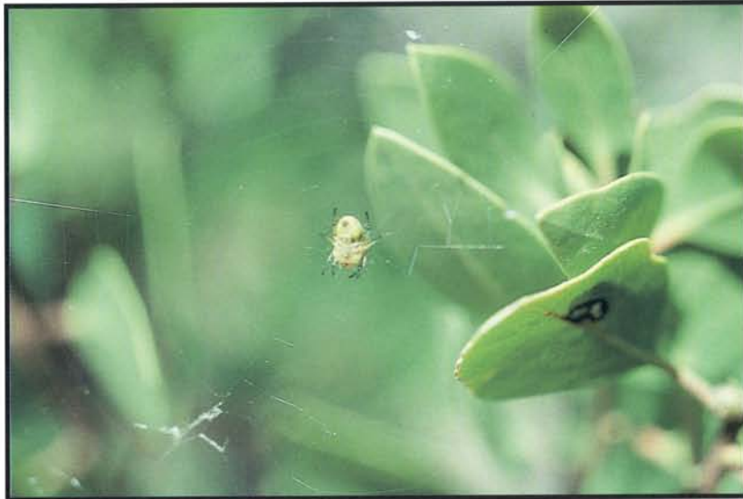
Figure 28 —Unidentified orb weaver spider (Araneae).