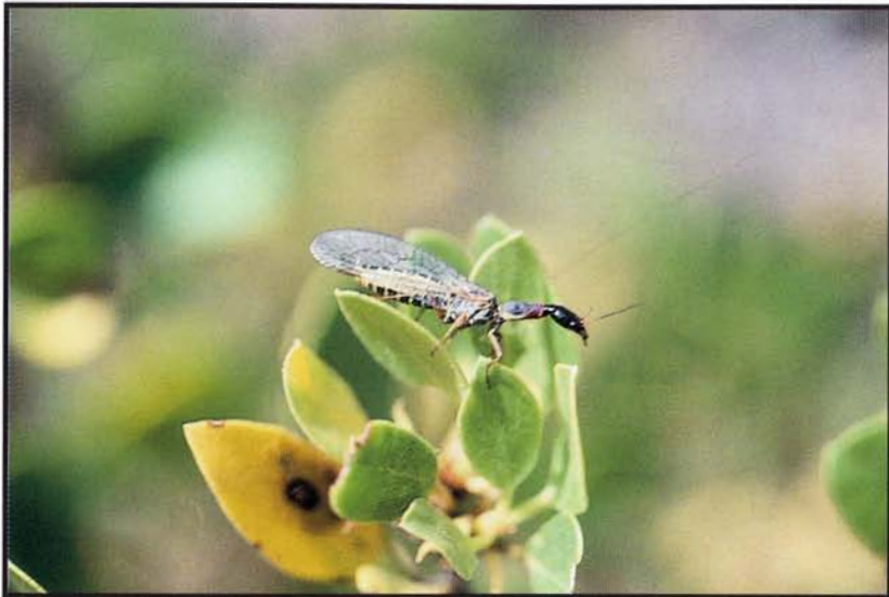
Figure 25 —A male snakefly, Raphidia unicolor (Carpenter) (Neuroptera: Raphidiidae). Snakeflies feed on soft-bodied arthropods and are extremely common during the summer months.