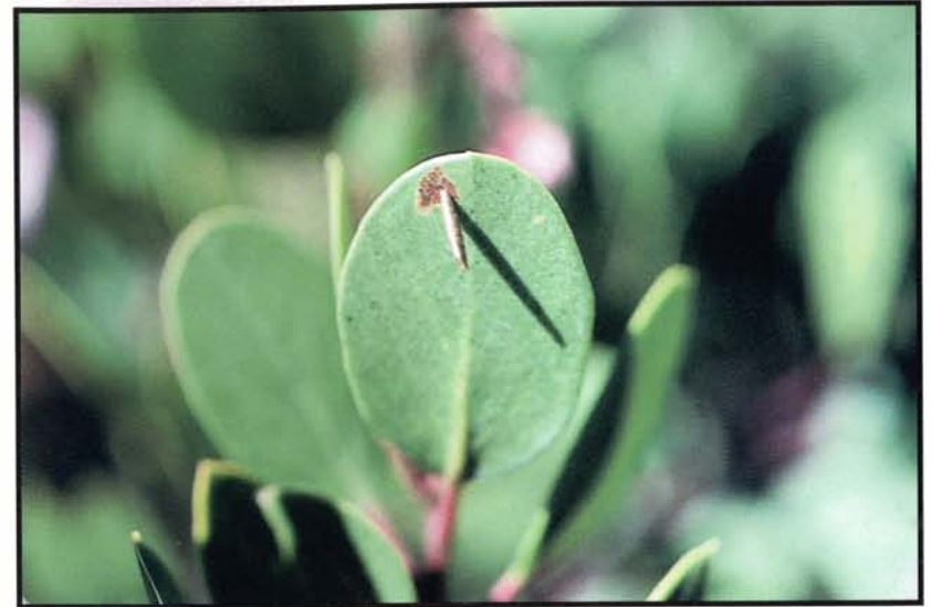
Figure 15 —A case bearer, probably Coleophora glauccella Walsingham (Lepidoptera: Coleophoridae), and its characteristic damage to a greenleaf manzanita leaf.