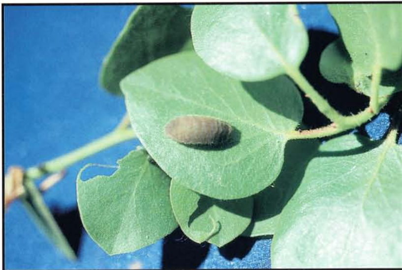
Figure 16 —The slug-like caterpillar of Incisalia augustus iroides Boisduval (Lepidoptera: Lycaenidae). This larva grazes the surfaces of leaves and fruits.