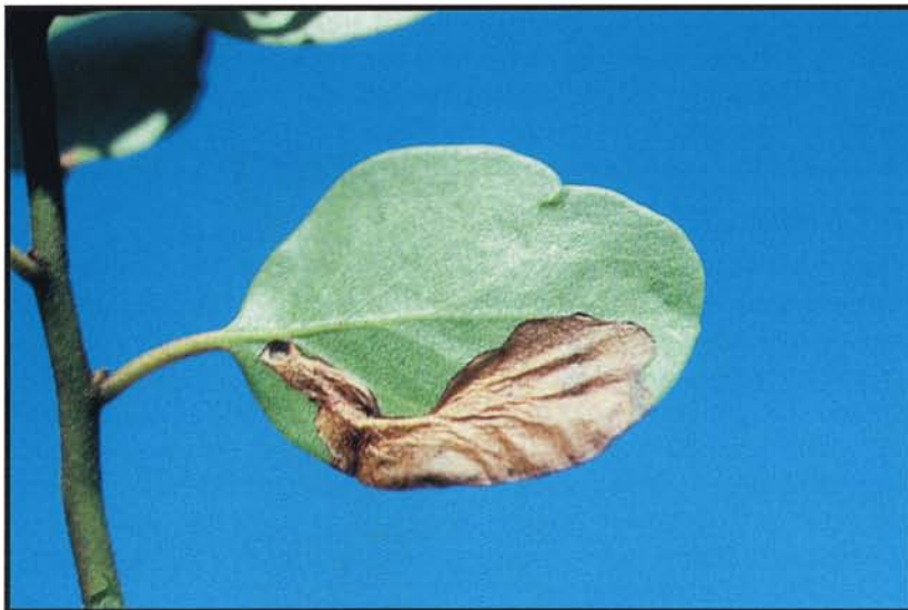
Figure 9 —Characteristic leaf mine caused by Epinotia miscana (Kearfott) (Lepidoptera: Tortricidae) (note adult exit hole near base of leaf).