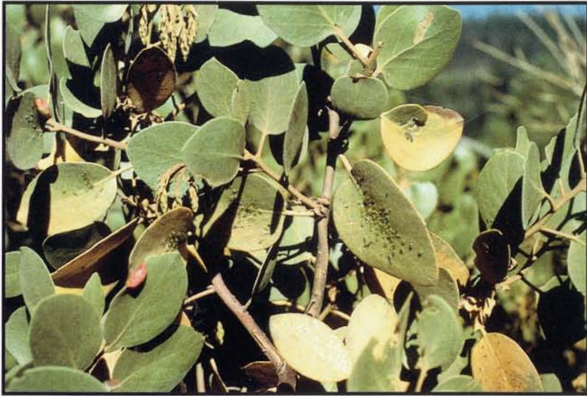
Figure 11 —Non-gall forming aphids (Homoptera: Aphididae) congregated on a leaf (also note two leaf galls in the photograph).