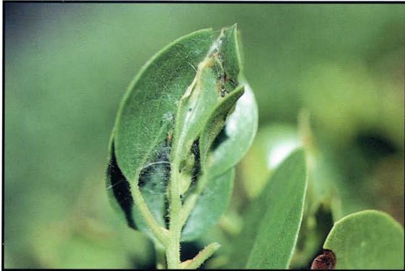
Figure 5 —Greenleaf manzanita leaves tied together with silk from an unidentified caterpillar in the family Gelechiidae or Tortricidae (Lepidoptera).