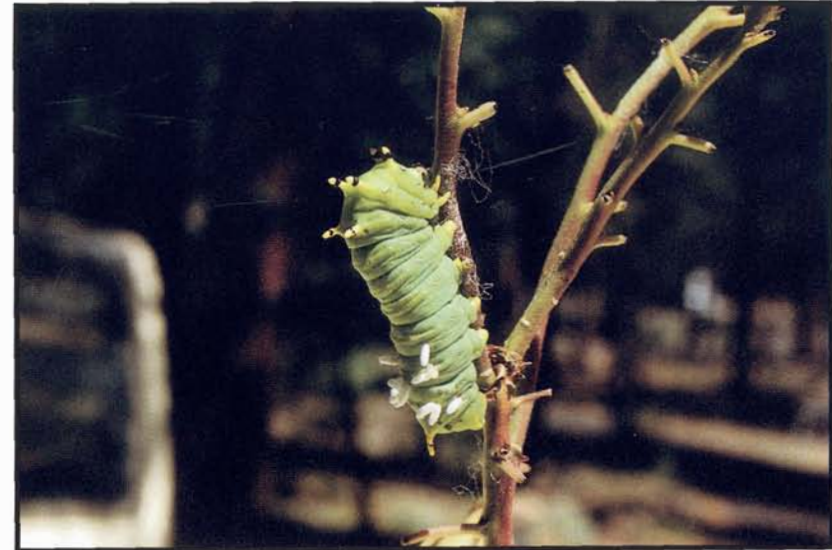
Figure 32—Parasitoid cocoons (Hymenoptera: Braconidae) on a mature ceanothus silk moth larva, Hyalophora euryalus (Boisduval) (Lepidoptera: Saturniidae).