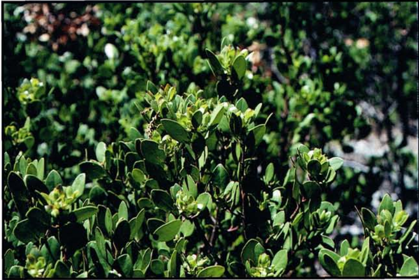
Figure 1—Greenleaf manzanita in Shasta County, California, several days after budbreak.