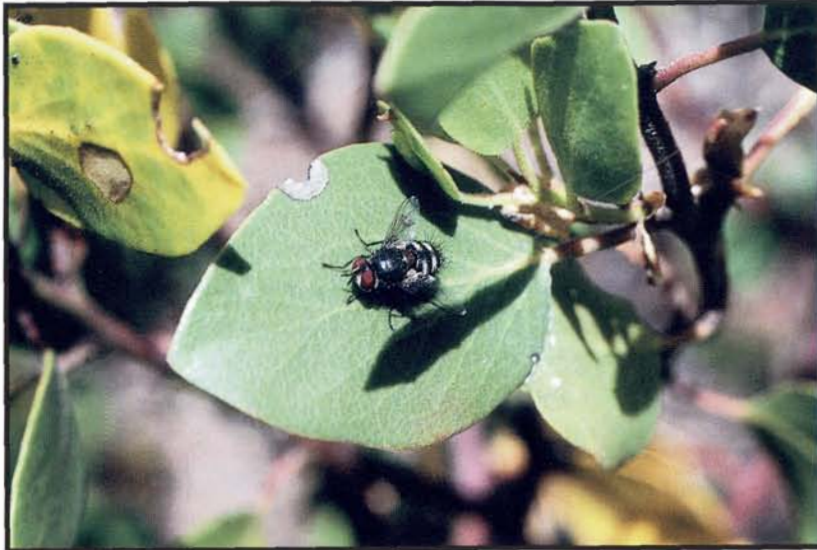
Figure 31—Adult tachinid fly (Diptera: Tachinidae) resting on manzanita leaf.