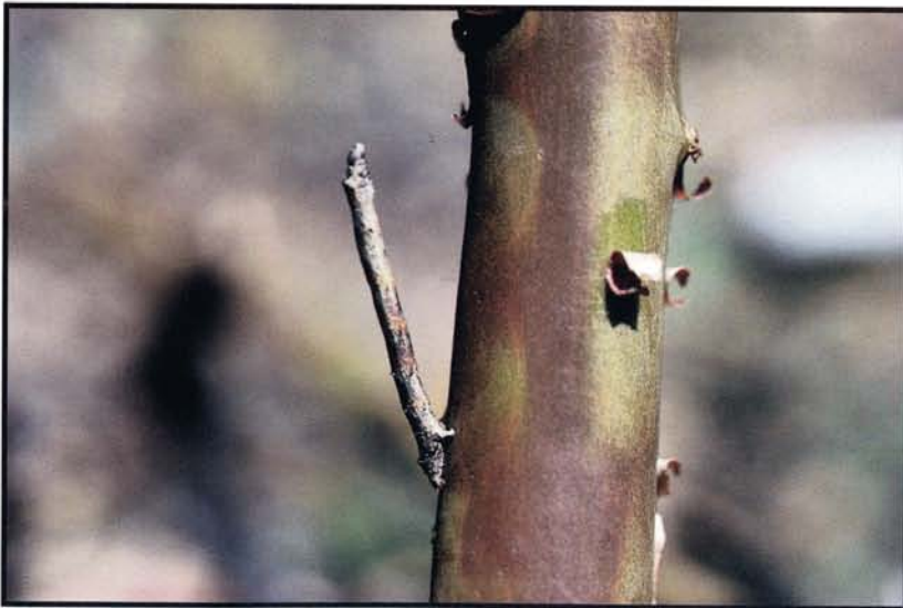
Figure 20 — Synaxis cervinaria (Packard) (Lepidoptera: Geometridae) fourth larval instar. Larvae mimic dead and dying manzanita twigs (see Valenti and others [1997] for details on the biology and ecology of this species).