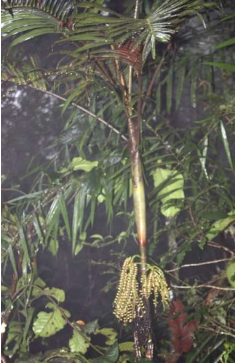
Figure 9: Pinanga urosperma Becc., type host plant of Ceropupa adams sp. n.

making the tribe Sikaianini well represented in the country, with five genera and nine species.