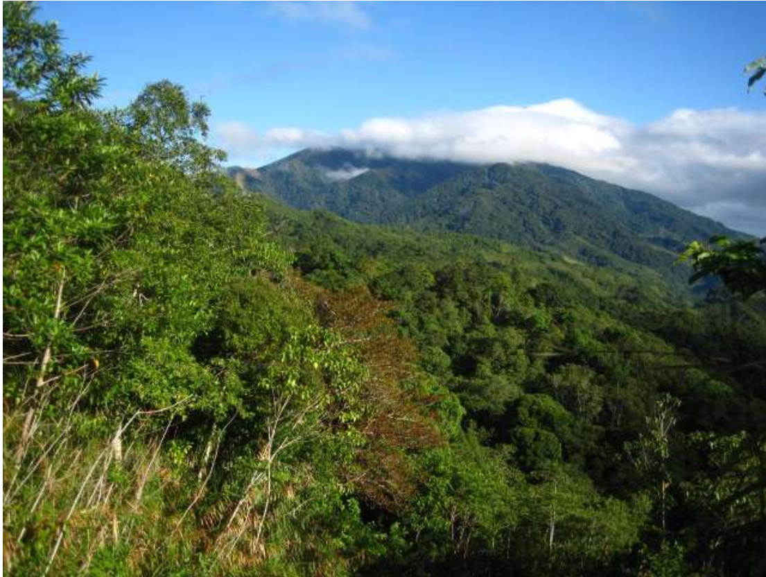
Figure 1: Mt. Pao, Adams, Ilocos Norte, type locality of Ceropupa adams sp. n.

description is based mainly on the lead author’s observations during field work. It is a less disturbed tropical lower montane forest. As you enter deep into the forest, the crowns become overlapping, limiting the entry of sunlight. Species that are not shade-tolerant thrive only at the edges of rivers, creeks and streams. The species below the trees rely only on crown gaps for their light requirements. Brown et al. (2012) showed some photographs of the inner portion of the forest. The forest floor is inhabited by ferns, vines, saplings, seedlings, pandans, palms and herbs.