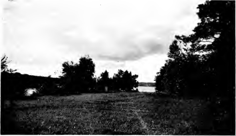
Penikese. The first work ever done on the fauna of the Island was done here.