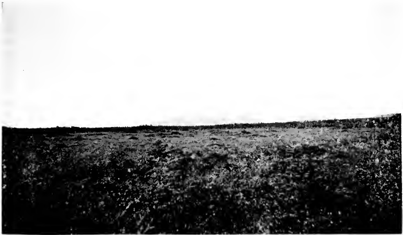
Sea Wall Bog with Western Mts. in distance

the proximity of the ocean with its modifying effect on the climate is apparently due this extension of southern species far beyond their normal habitat. On the other hand, cold currents produce conditions favorable to boreal species. The effect of the ocean on temperature is perhaps best shown at Sable Island. 5 "A study of the temperature will show that there are no extremes of heat or cold on the island; that the highest temperature during the past four years was 78° and the lowest point reached by the thermometer during the same period was 5° above zero."