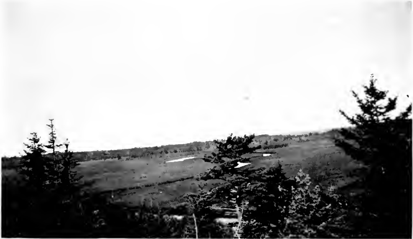
The Great Heath