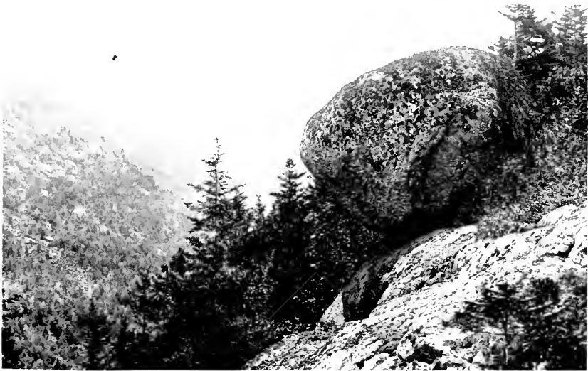
A Glacial Boulder