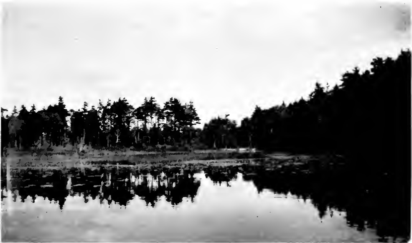
The Toad Hole