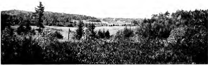
The Emery District

Approaching sea level; swamps and "heaths" are formed where the water is fresh from the land drainage above or salt from the sea's penetration. Such a place is the bog back of Sea Wall and Great Heath in the northwestern part of the island, which is over 2 miles long and is a mile wide in one place. In these the vegetation is brush such as Myrica gale , Kalmia , and the like, while the floor of all of them is Spagnum . These places yield insects and at the same time, test one's endurance.