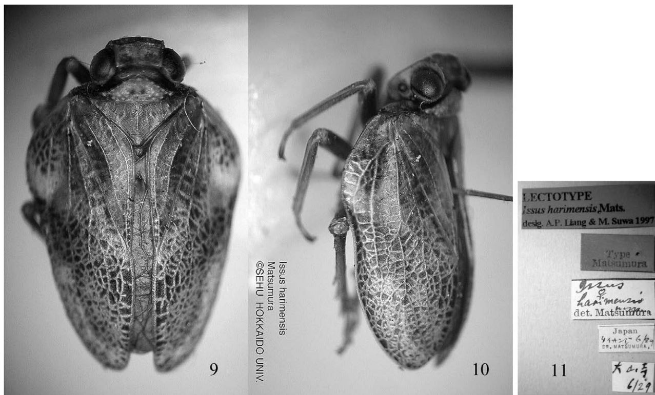
Figs. 9–11. Rhombissus harimensis (Matsumura) (lectotype of Issus harimensis ). 9 – Dorsal view; 10 – lateral view; 11 – labels. Length of hind wing, 4.5 mm.

branches, cubitus anterior simple (R 2 M 2 CuA 1). Radius furcates closely to basal cell, median – near to wing middle. All main veins reticulate in distal half of the wing (Figs. 9, 10). Clavus long, its apex reaching wing middle, opened (Pcu + A 1 running to its apex). Hind wings well developed, as long as fore wings, bilobed with deep marginal cleft (cubital cleft) and reticulate venation (Fig. 8). Hind tibia with 3 lateral spines and 8 spines on the apex. First metatarsomere slightly longer than second one, with two latero-apical and 6–7 intermediate spines in row. Arolium of pretarsus almost reaching claw apices (in dorsal view).