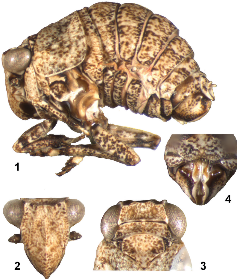
Figs 1–4. Campures pallens gen. et sp. n., holotype: (1) lateral view; (2) frontal view; (3) head and pro- and mesonotum, dorsal view; (4) ovipositor and VII sternum, ventral view. Total length of the specimen: 3.2 mm.

Coloration: General coloration light-brown yellowish with dark-brown spots and dots (Figs 1–4). Genae with dark-brown spot above the scapus. Pedicel dark brown with light-yellow sensory organs. Postclypeus with large oval dark-brown spot on each side. Apex