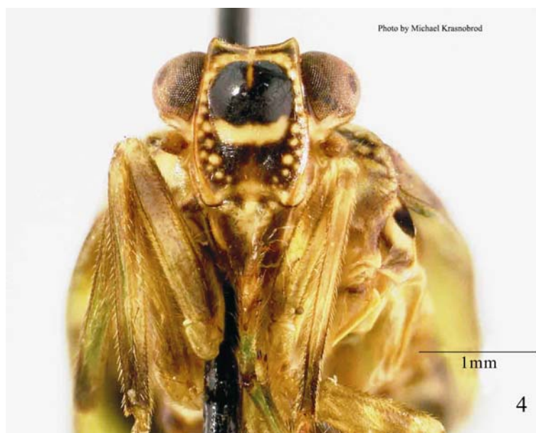
Figure 4. Tetricodes polyphemus Fennah, holotype, frontal view.

Both species described by Zhang and Chen are from Guizhou Province (Zhang & Chen 2009), but the holotype of T. polyphemus is from Hubei Province (Fennah 1956). In this situation I suggest a narrow concept of T. polyphemus based on the original description (Fennah 1956) until the illustrations of a male from the type locality are obtained. Accordingly, the species described by Zhang and Chen as T. polyphemus is a new species (Fig. 3).