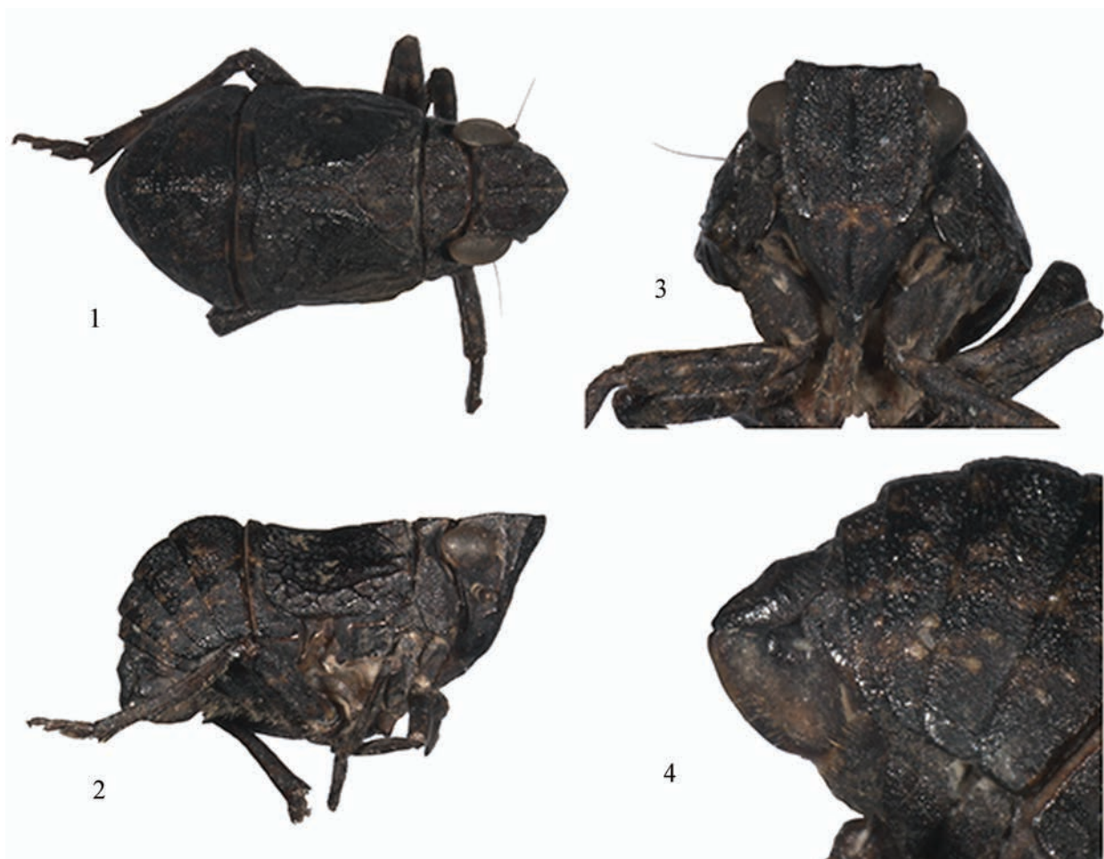
Figs 1–4. Thaiscelis alutaceus gen. et sp. nov., holotype. 1 – dorsal view, 2 – lateral view, 3 – frontal view, 4 – ovipositor, lateral view. Total length of the specimen – 4.0 mm.